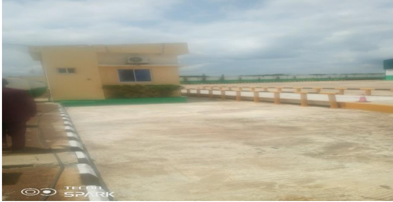
Plate XXII: Picture Showing Tiamin scaling area