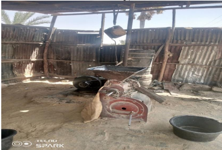
Plate III: one of the milling shade in Polchi Ward