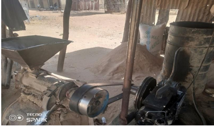
Plate V: one of the milling shade in Bununu South Ward