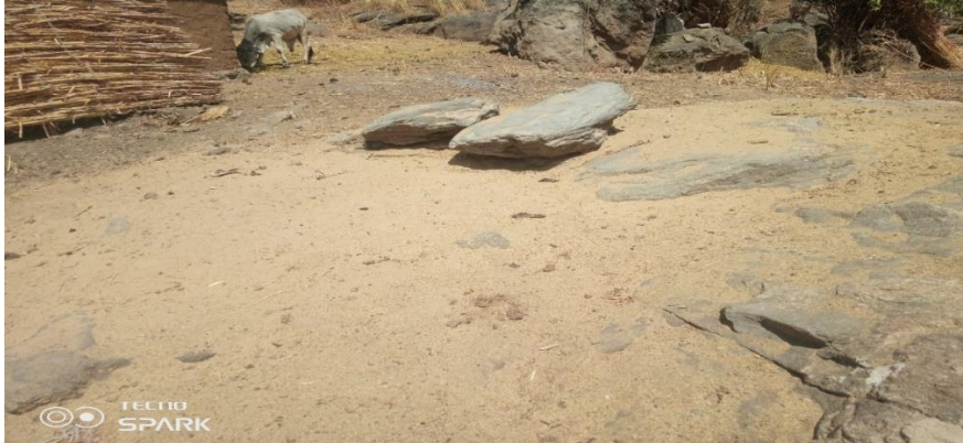
Plate XI: feeding Animal with rice husk at Wandu ward of dass local government