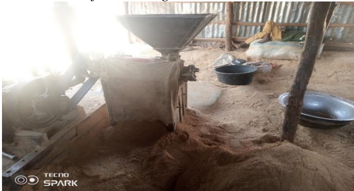
Plate VI: one of the milling shade in Bununu Central Ward