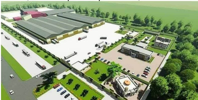
Plate XX: Picture Showing Tiamin Rice Mill General Layout