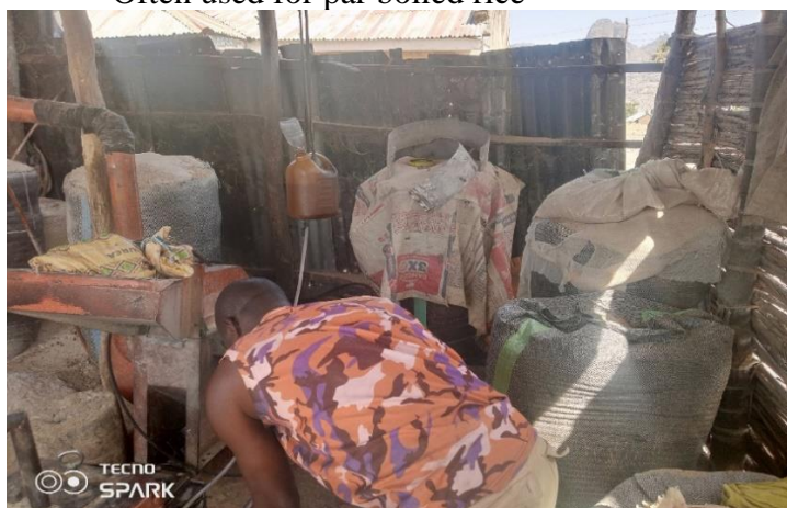
Plate I: one of the milling shade in Baraza Ward