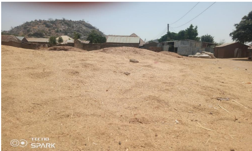
Plate XIII: open dumping of rice husk at Dot Dass