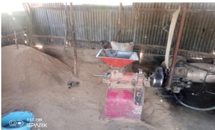
Plate IV: one of the milling shade in Wandu Ward