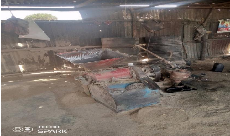
Plate VIII: one of the milling shade in Dot Ward