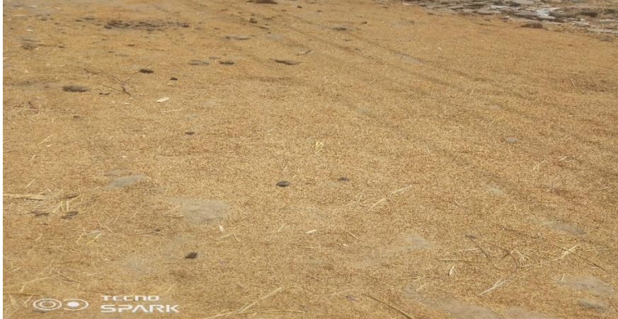
Plate XII: Rice husk spread on the filled to decay and serve as compost at Wandu ward of Dass Local Government