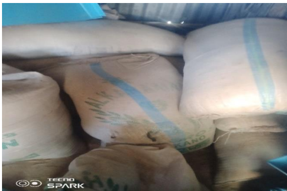
Plate IX: gathering of husk in sacks for disposal

This differ from the type of rice and the level of ripeness of the paddy the more the ripeness of the paddy the less the quantity of rice husk from the paddy and vice versa, also the quantity of rice husk differs from parboiled and raw paddy, as more rice husk is generated from raw rice as compared to parboiled rice however for every 3bags of 100kg milled rice there is an average full up of 1bag of 100kg