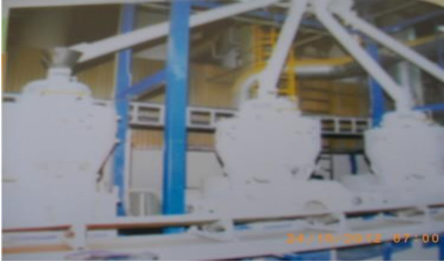
Plate XVII: Milling machine