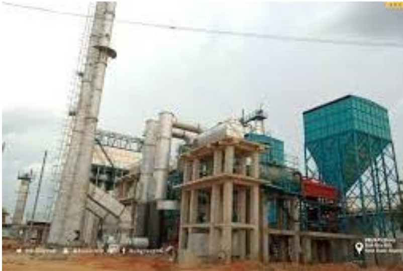
Plate XIV: IRS rice milling factory kano

Founded in 2003 by the Islamic Scholar and Industrialist Sheik Khalifa. The Rice mill received a boost in 2011 by a huge investment made by Fidelity Bank. It has continually grown since then. It is 100% indigenous and make use of indigenous rice. It has the 24,000 metric tons Capacity per annum Products of white parboiled rice it have 231 staff: 76 permanent staff and 152 temporary staff, it source it raw materials from industrial farmers, local markets and company. It has the following facilities: Administrative block, Production hall, Ware House, Functional generator room