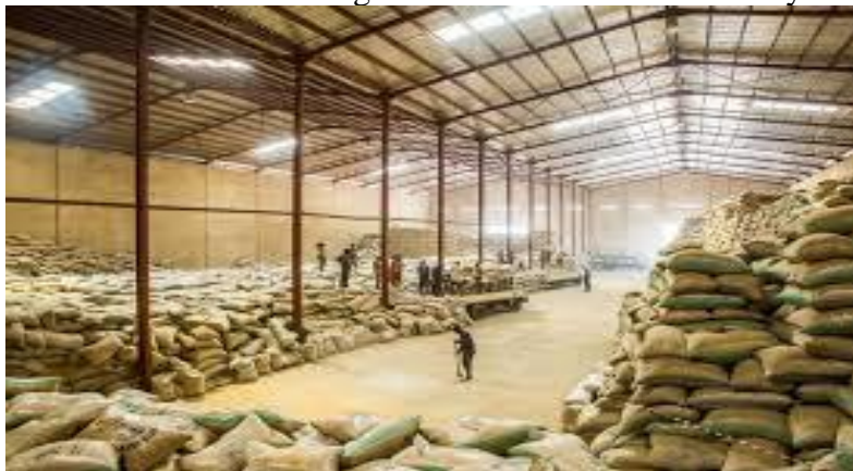
Plate XXI: Picture Showing warehousing