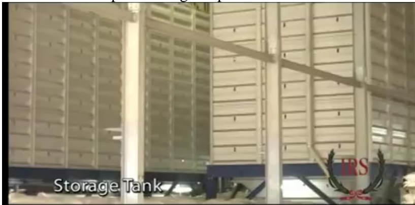
Plate XV: IRS rice milling factory KANO

Portal frame roofing system is used for the production hall. Some parts of the exterior walls are only covered with roofing sheets. The roof is pitched with long span aluminum roofing sheets laid on the steel sections of the partial frames. Parts of the exterior walls are painted with text coat paints while some parts with gloss paints.