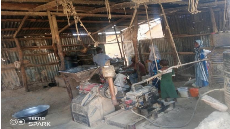
Plate VII: one of the milling shade in Bundot Ward