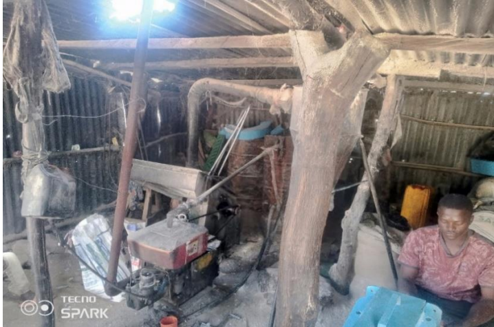
Plate II: one of the milling shade in Durr Ward