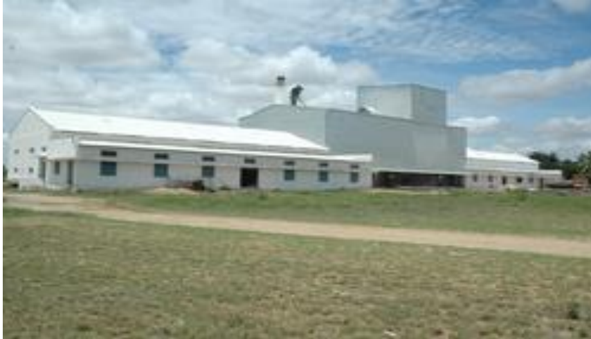
Plate XVIII: Picture Showing Amk Alayam Modern Rice Industry