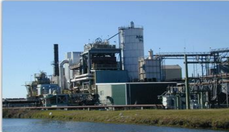
Plate XIX: Picture Showing Dhanalakshmi Modern Rice Mill

Dhanalakshmi Hi-Tech Modern Rice Mill, shortened to DHM Rice Mill is a proud manufacturer of SINGAM MARK (Lion Brand in English) rice varieties. It is a second generation rice mill with Hi-Tech status. they inherited their brand name and expertise from Dhanalakshmi Rice Mill, an upcoming silver jubilee concern known for its best quality offering till date.