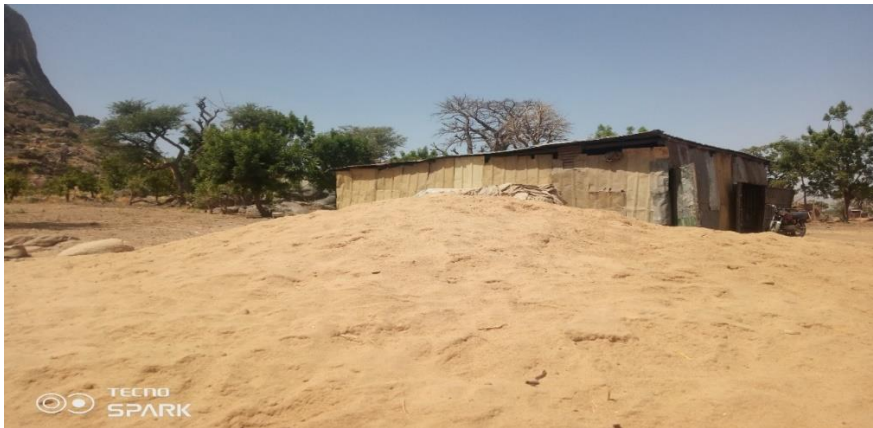
Plate X: open dumping of rice husk at Bundot dass,

Waste Disposal. To determine the methods used for the disposing of rice husk waste in the study area the Integrated Sustainable Waste Management (ISWM) approach was used as yardstick of measurement, they include: Recycle, Reuse, Reduce, Land fill, burning (open burning), animal feeds, and composting. However cross case analysis is used to analyse the waste disposal methods in various locations