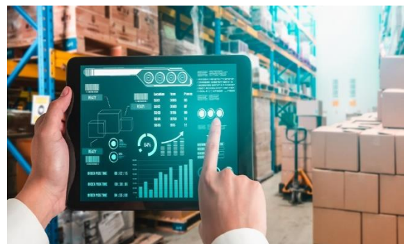
Fig 2: Smart Inventory Monitoring

The illustration depicts a contemporary warehouse setup with an intelligent inventory management system. A mobile device is showing