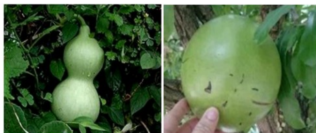
Figure 1 (a) Bottle Shape (b) rounded Shape of popular Calabash in Northern Nigeria

Lagenariasiceraria a member of such family, a monocotyledonous flowering plant commonly known in Hausa language as 'kwarya or duma' and calabash in English. It possesses simple leaves which are 400mm long and 400mm broad, oval shape and whitish seeds embedded in a spongy pulp, 7 – 20 mm long (Welman, 2005). They were widely grown in Northern part of Nigeria for excavation of domestic utensil and food containers and 12 to 16 inches high with 20inch diameter, when dried have approximately ½-inch thickness.(Ibrahim et al. , 2016).The fruits of these species contain vast number of seeds that have no commercial application in the locality they were produced. Lagenariasiceraria species (including Calabash) are among the cultivated crops in the north-western region of Nigeria that have no established large scale application. It has relatively short maturity time of about 3-4 months and produces large amount seeds with up to 50% inedible oil content and thus with stable price that may not subject to distortion by food prices. Ibrahim et al. , 2016).