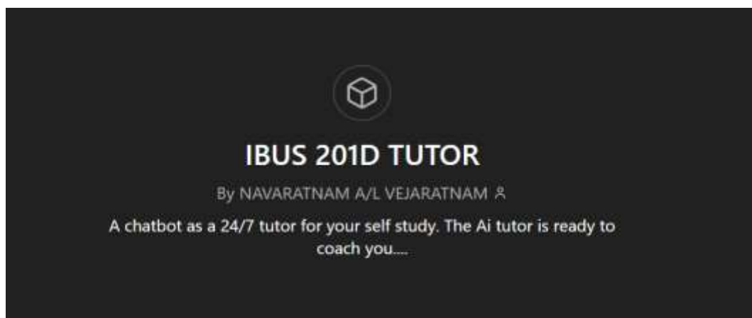
Figure 1: AI Chatbot for a Subject in the Diploma Program

In recent years, AI-powered chatbots have emerged as important tools to address the growing demand for academic support (Gonzales-Reyna, 2025). One such innovation is ChatGPT, built by OpenAI which is among the best-known efforts in this area. Using natural language processing, it engages users through interactive dialogues providing them assistance and explanations in real-time. ChatGPT used in educational places had been found to help in autonomous learning and ease access to academic help beyond the class hours (Gonzales-Reyna, 2025). In practice, AI chatbots have been deployed at universities to automate the answering of student questions. A teaching assistant chatbot, for instance, was able to process thousands of enquiries resulted in greater access to assistance for (Alsafari et al., 2024; Gonzales-Reyna, 2025; Kothawade, 2025). These initiatives suggest growing acceptance for chatbot technologies within academic settings. Below is the example of the chatbot created by the corresponding author.