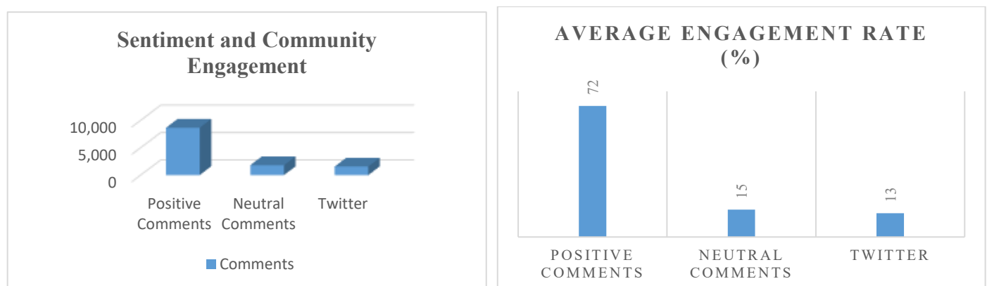
Figure 2: Sprout Social Data Analysis (Sentiment Analysis of Comments)

The sentiment analysis conducted using Sprout Social further underscores the importance of content type in fostering social capital. Posts featuring personal stories yielded a 20% higher engagement rate than corporate updates, and community calls to action prompted 35% more shares compared to informational posts. This highlights the role of personal narratives and engagement prompts in building trust and encouraging deeper connections among community members. These findings align with the work of Putnam (2000), who emphasized the importance of personal ties and trust in the creation of social capital. Moreover, polls and surveys, which saw a 50% higher comment rate per post, also demonstrate how participatory content can drive more meaningful engagement. By inviting followers to share their opinions and engage in decision-making, such content promotes a sense of belonging and ownership within the community, a core component of social capital (Johnson & Lee, 2022).