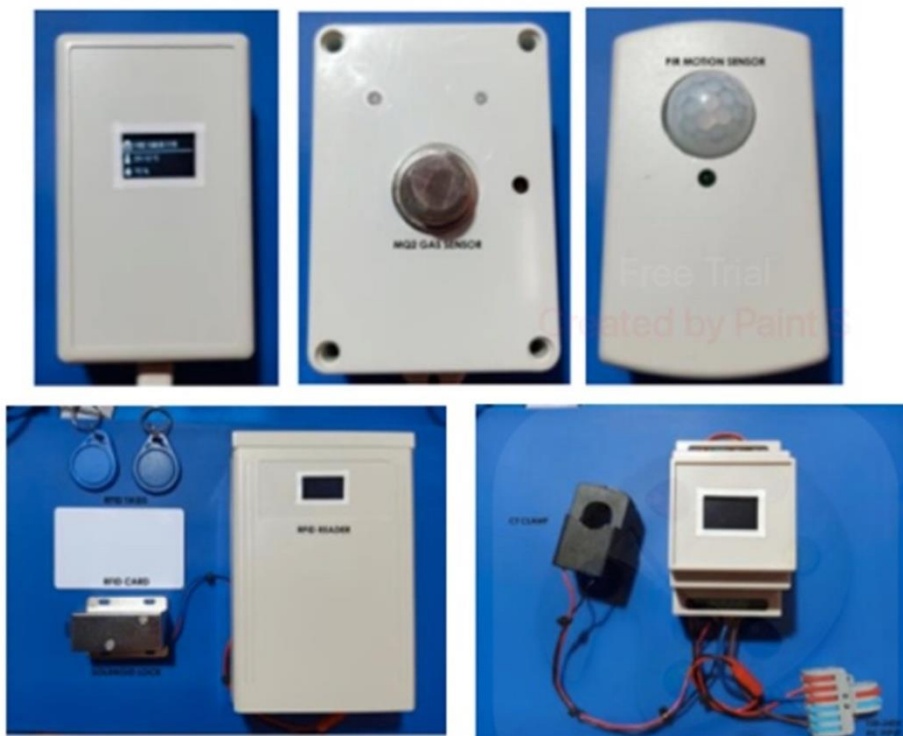
Figure 3. Some of the Modules Included in the Project

This study developed an IoT-Based Home Automation System designed to enhance household convenience, security, and energy efficiency through intelligent monitoring and control. The system integrates key hardware components, including the Raspberry Pi 3B+, NodeMCU, and ESP32 microcontrollers, along with various sensors and actuators. Supported by Home Assistant, ESPHome, and Cloudflare technologies, the system enables real-time monitoring, secure remote access, and seamless integration of multiple devices, forming a robust and interconnected smart home environment.