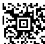
Fig. 5 Two-dimensional QR bar code [175]

Instead of bars and spaces, 2-D barcodes combine spaces, dots, alphanumeric, and numeric data in an array or matrix to contain much more data in far less space than 1-D barcodes (Figure 5) [4]. They can be printed directly on the packaging or affixed to packaging as stickers, providing consumers with further information on the product or a link to a web page with more information [176]. There are several standardized 2-D barcodes used in the food industry, for example DataMatrix, QR Code, Nex Code, Aztec Code, etc. [174].