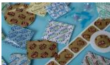
Fig. 3 AGELESS® (OS-film, Mitsubishi Gas Chemical Inc., USA) [26]

2) CO 2 scavengers - CO 2 is a byproduct of catabolic activities in biological systems, and its content inside the food package can be elevated owing to fermentation, respiration, and browning reactions in particular foods [16]. For instance, non-enzymatic browning processes in roasted packed coffee beans can release up to 15 atm of dissolved CO 2 , resulting in alterations in product flavors and aromas as well as the development of undesired anaerobic glycolysis in fruits [15], which can cause the package to burst [10]. Fermented products such as sauerkraut, sauces, pickles, and some dairy products such as yogurt and cheese [40] can produce CO 2 after the process of packaging due to their microbial activity [16]. Excess CO 2 production can cause collapse or unfavorable changes in food texture and flavor, as well as browning discoloration, off-flavor generation, and tissue degradation in foods including potatoes, lettuce, carrots, onions, cauliflower, peaches, and apples [26].