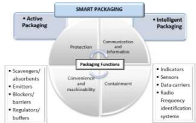
Fig. 1. Technologies of smart packaging, their classification, and food packaging

identification and traceability [15]. Figure 1 depicts the technologies of smart packaging and categorization, and their contributions to food quality and safety improvement.