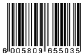
Fig. 4 One-dimensional bar code [174]

and information. The fundamental concept is similar to a laser beam cutting a horizontal slice from vertical code bars. Then the beam records the amount of time it takes to scan dark lines and bright regions as it goes over the symbol (Figure 4) and decodes the data into specific information [2].