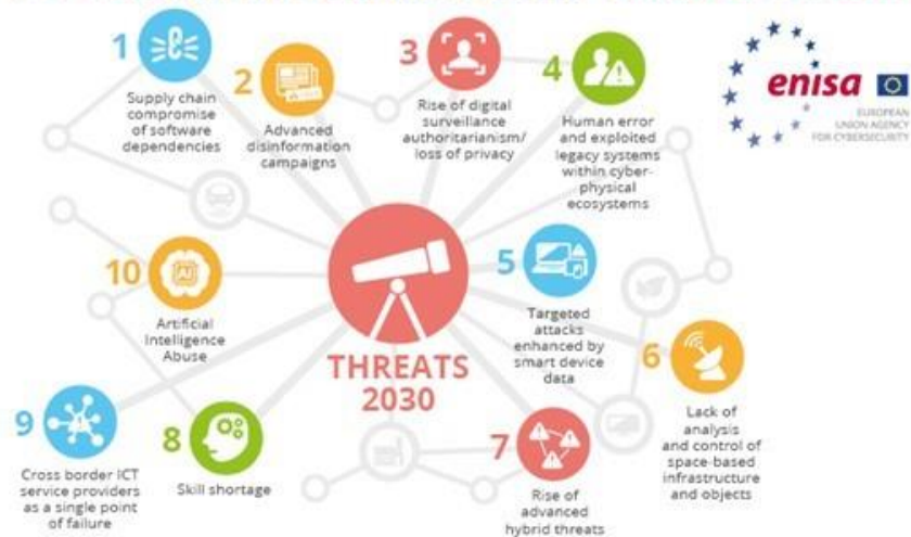
Figure 3: Emerging threats to network security