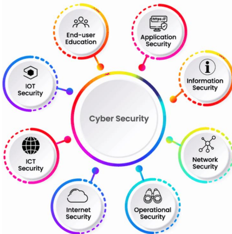
Figure 1: The Critical Role of Network Security in Today’s Digital Landscape

The key contribution of network security in rendering data confidentiality service should not be underestimated as data breaches and cyberattacks present huge danger and risk to both organizations and private individuals (Sharma & Barua, 2023). The 2021 Cost of a Data Breach Report survey by IBM has shown that the average global cost of a data security breach is equal to $4.24 million, and the healthcare sector was paying the highest average cost per compromised record at $9.23 million (Almulihi et al., 2022).