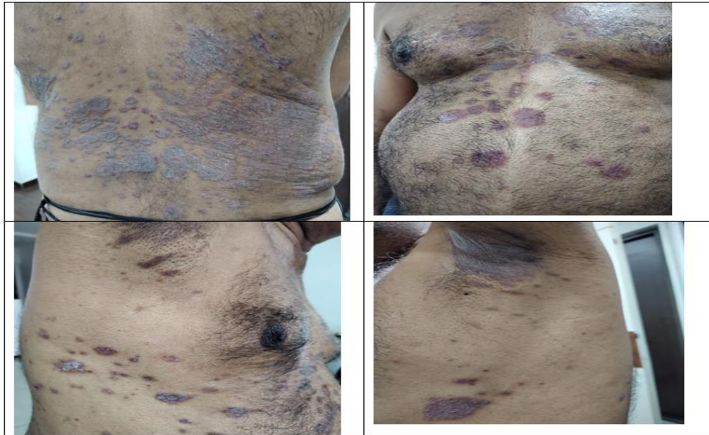
Figure 3 -After treatment