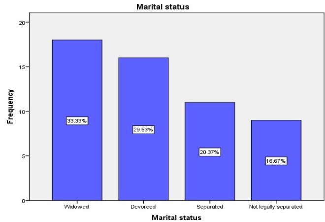
Graph 2 - Marital status of Single mothers

Most of single mothers were between age group 34-40. Out of the total sample, 63% of single mothers were found age group 35-40. Only a limited number of single mothers were reported to be age group 17-22. From the subjects considered, 3/4 th was Sinhalese. Tamils & Muslims were 9% and 15% respectively. These percentages match with the respective ratios of the country. Again, from the subjects 3/4 th was Buddhists. And Islamic & Hindus were 11% and 13% respectively.