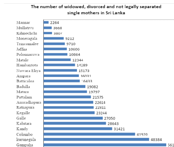
Graph 1: The number of widowed, divorced and not legally separated single mothers in Sri Lanka.

(Department of Census and Statistics, 2012)