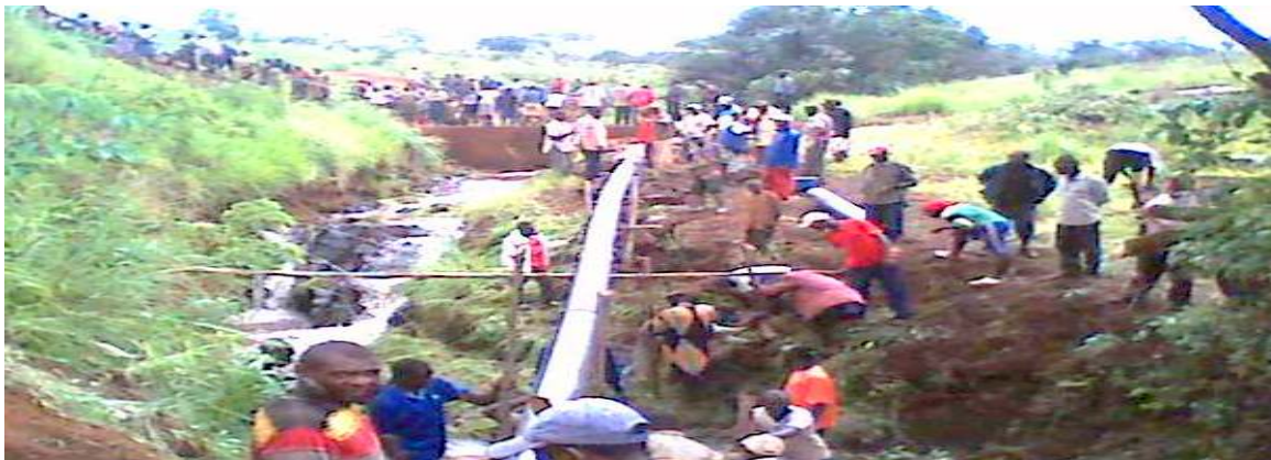
Photo2: labour provision by Shiy villagers for community development. Villagers assisting to put in place the pipe line for their SSHEP scheme. Photo by Bongwirns Emmanuel (project technician), Nov. 2016.

participation in energy projects ([35], [36], [37], [33]). In shiy village, the community was mobilised to provide labour required in the construction of the SHEP plant; photo 3. This mobilisation is in line with the importance of identification with a place-based community in facilitating participation: a sense of belonging to a particular place is observed to inspire voluntary efforts to develop community renewable energy to generate local benefits ([35], [8], [37] [32]). This sense of belonging and place attachment has been observed to be mutually reinforced through participation in community projects ([38], [39], [40] [41]).