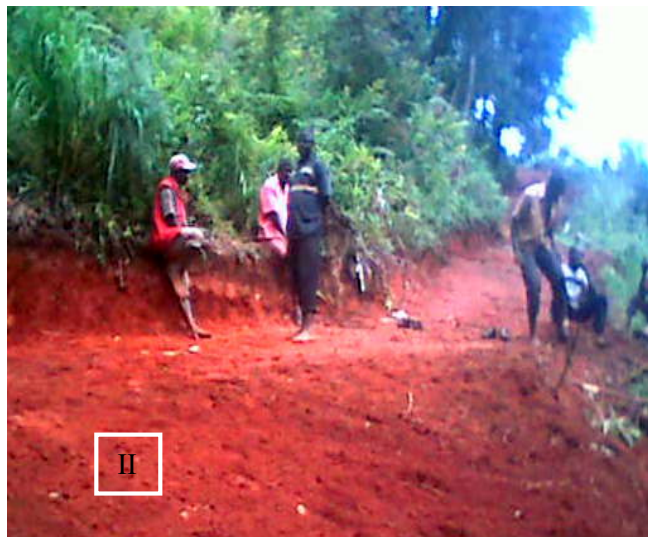
Plate 1: Self-reliant development.

Villagers involved in the construction of their roads. Photo I: the road leading to Kingomen. Photo II: the road leading to the power house. Photos by Bongwirnsso E. April 2016.