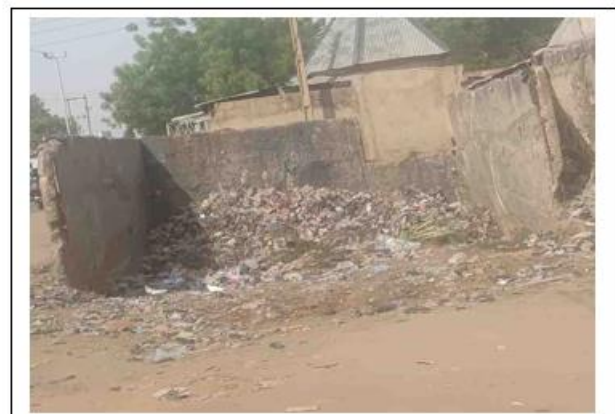
Figure 4 Waste Dumpsite at Kanwuri Area, Sokoto.