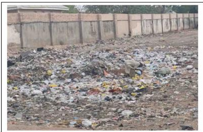
Figure 3 Waste Dumpsite at Diplomat Area, Sokoto.