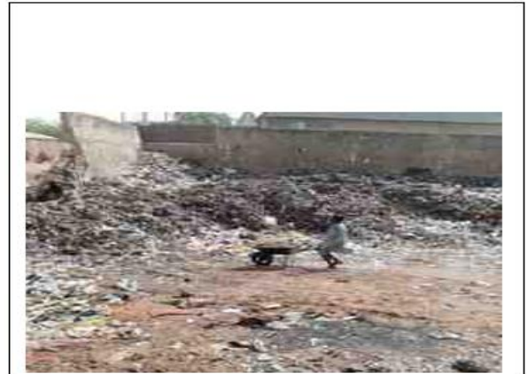
Figure 6 Waste Dumpsite at Almustapha Road, Sokoto.