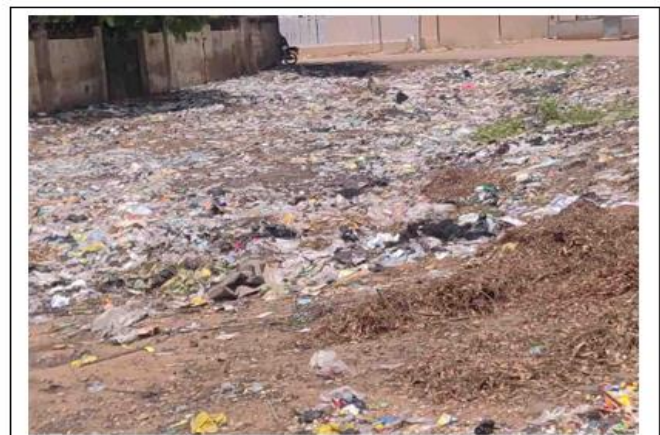
Figure 8 Kanta road, Sokoto.

Findings of the study further reveal that majority of the respondents have no designated waste disposal site. This is because, four out of the six authorized dumpsites are located in the sub-urban area of the Sokoto metropolis. Leaving the traditional urban core areas of the metropolis with only two, and Government reservation areas with none. Impliedly, the agencies entrusted with managing waste in Sokoto metropolis had not taken in to cognizance how the city grew. This is highly inadequate given that the population of Sokoto urban area has reached 903,328, with an annual growth rate of 3.01%, and considering the limited capacity of the existing dumpsites as well as their inability to meet the standards required for designation as proper dumpsites under United Nations guidelines.