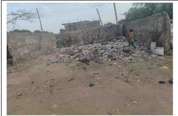
Figure 5 Waste Dumpsite at Dallatu Road, Sokoto.