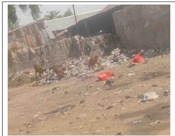
Figure 7 Waste Dumpsite at Sultan Abubakar Road, Sokoto.