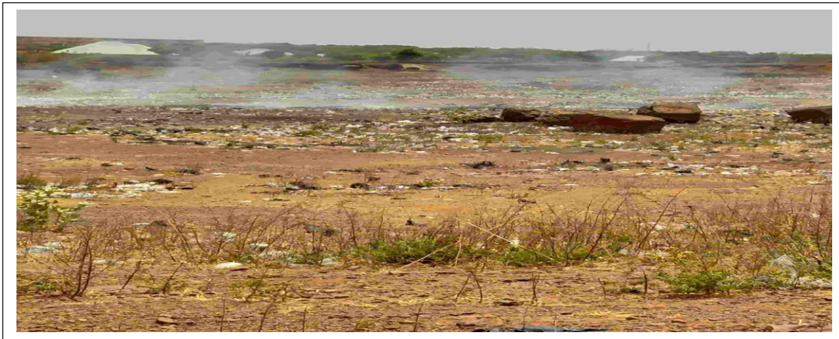
Figure 9 Waste Disposal site at Kwannawa area, Sokoto.