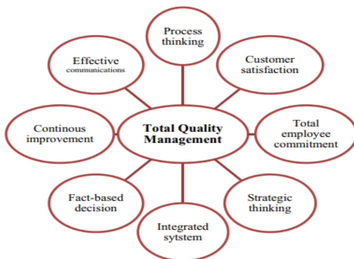
Figure 1 Principles of Total Quality Management (TQM)- (AlHumud et al., 2023)