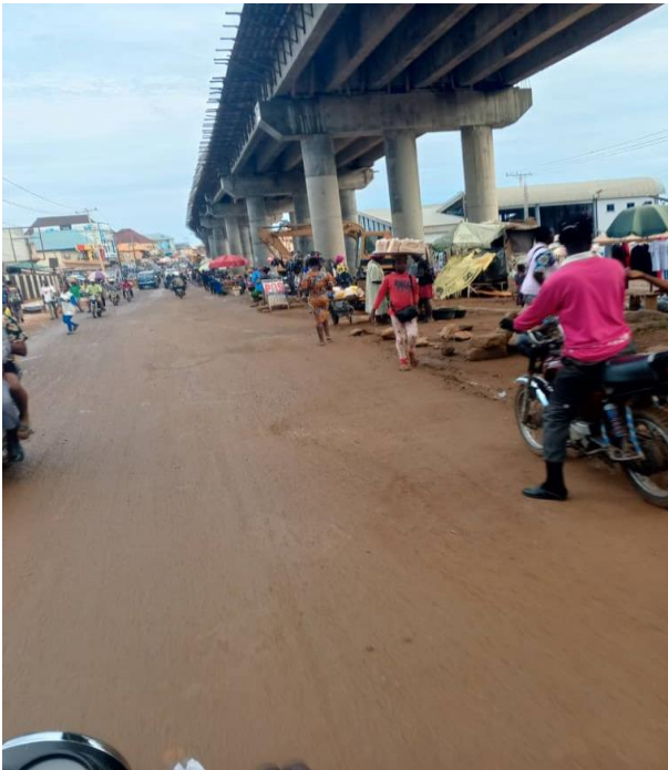
Plate 3: Ongoing Bridge Development to improve accessibility

These results support Oyesiku's (2002) position that well-planned transportation interventions contribute to the efficiency of urban systems. The Old garage - Ijigbo Bridge, in particular, has demonstrated that targeted infrastructure in flood-prone, mobility-constrained urban zones can yield significant transportation benefits in secondary cities like Ado-Ekiti.