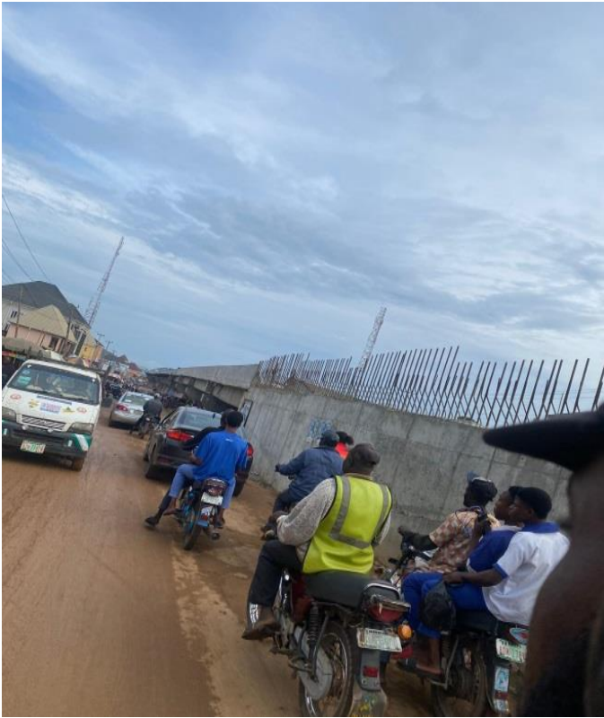
Plate 2: Traffic Congestion due to the current bridge development in the study are

These results support Oyesiku's (2002) position that well-planned transportation interventions contribute to the efficiency of urban systems. The Old garage - Ijigbo Bridge, in particular, has demonstrated that targeted infrastructure in flood-prone, mobility-constrained urban zones can yield significant transportation benefits in secondary cities like Ado-Ekiti.