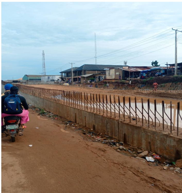
Plate 1: Ongoing Bridge Construction

The reduction in commute time and enhanced movement reported by 87% of respondents aligns with global and national studies that identify infrastructure projects—especially bridge construction—as key to resolving urban mobility challenges (World Bank, 2020). Similar outcomes were observed in the Lekki-Ikoyi Link Bridge project, which significantly reduced congestion in Lagos (Ilesanmi, 2013). In Old garage – Ijigbo area, the improved pedestrian and vehicular accessibility facilitated by the bridge has not only resolved prior traffic gridlocks but also enabled smoother interconnectivity between key neighborhoods in Ado-Ekiti.