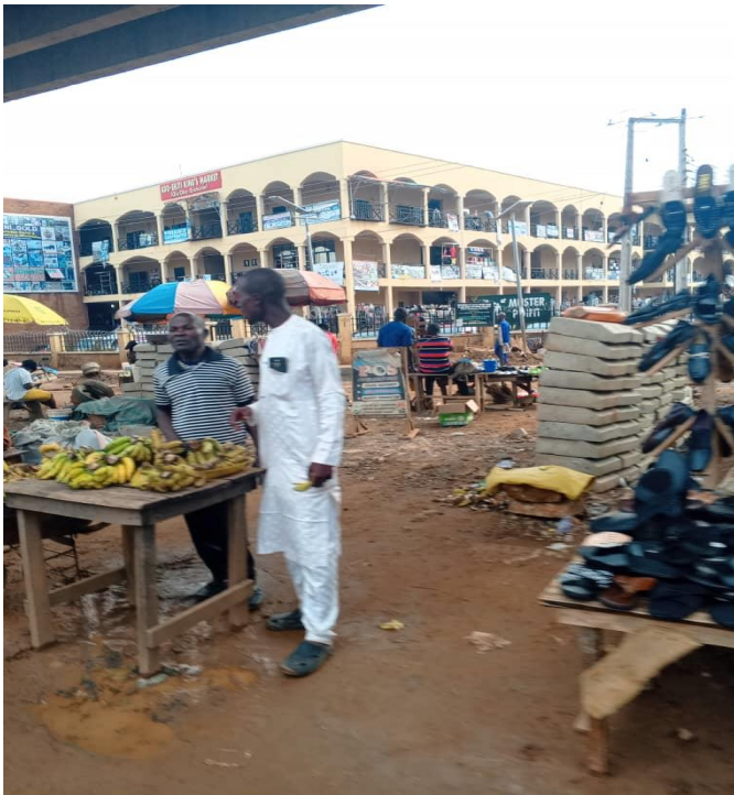
Plate 4: Trading Activities under the bridge

observed that improved access stimulates commercial activity by attracting more foot and vehicular traffic. In the Old garage – Ijigbo axis context, the bridge has effectively opened up market linkages and improved access to goods and services, resulting in increased economic opportunities for traders, artisans, and transport operators.