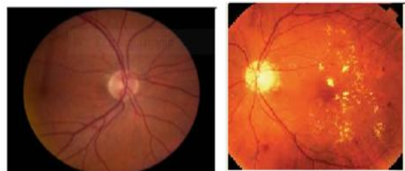
Fig. 2a). Normal Eye 2b). Diabetic Affected Eye Image

Analysis, Classification. Fig.2a). and 2b). Shows the Normal Eye Input eye image and Diabetic Affected Eye image.