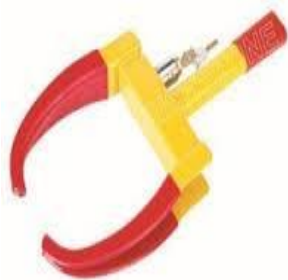
Figure 2.2: Jammer [3]

Vehicle towing is the procedure of towing away-vehicles parked in non-parking areas or in areas causing hindrance to the ongoing traffic, and wrecked vehicles. This process aims in penalizing users who park their vehicles in such areas. The vehicles are usually locked using jammers or are taken away to specific locations in cases where they cause hindrance to the ongoing traffic. The image shown below is of the jammer which is used to lock such vehicles.