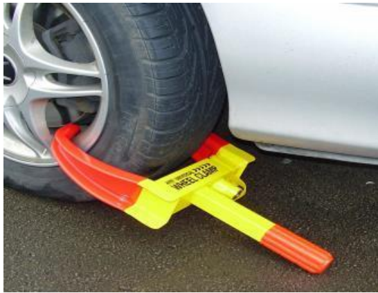
Figure 3.1 Car locked using a Jammer

poses an advantage over other methods deems the vehicle unmovable until the perpetrator pays the fine. The image shown below is an example of a car that has been locked using a jammer.