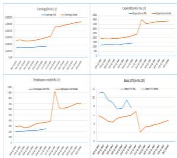
Figure. 1 Pre and post-performance of different parameters (Earnings, Expenditure, Employees Cost, Basic EPS)

The merger of Kotak Mahindra Bank and ING Vysya Bank is a case of integration of two equally strong corporate entities to achieve competitive advantage and market share. The event propelled the bank to fourth rank.