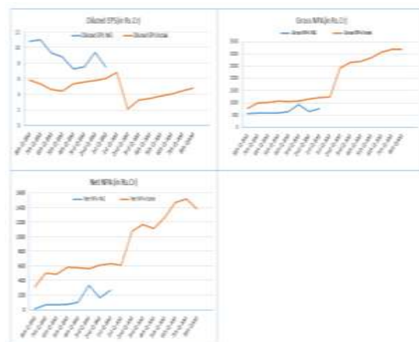
Figure. 2 Pre and post-performance of different parameters (Diluted EPS, Gross NPA)

The above analysis shows that, even though there is a sudden jump in the selected parameters close to the merger period and can be contributed to consolidation. It then regains the pre-merger trend. This is the case with earnings, expenditure and EPS etc. The only negative impact is on Net Non-Performing Assets which shows a rather increasing and irregular trend post the merger (fig. 2 panel 3)