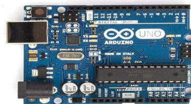
Fig2: diagram of arduino

Arduino UNO is a microcontroller board based on the ATmega328 (datasheet). It has 14 digital input/output pins (of which 6 can be used as PWM outputs), 6 analog inputs, a 16 MHz ceramic resonator, a USB connection, a power jack, an ICSP header, and a reset button. The Arduino UNO can be