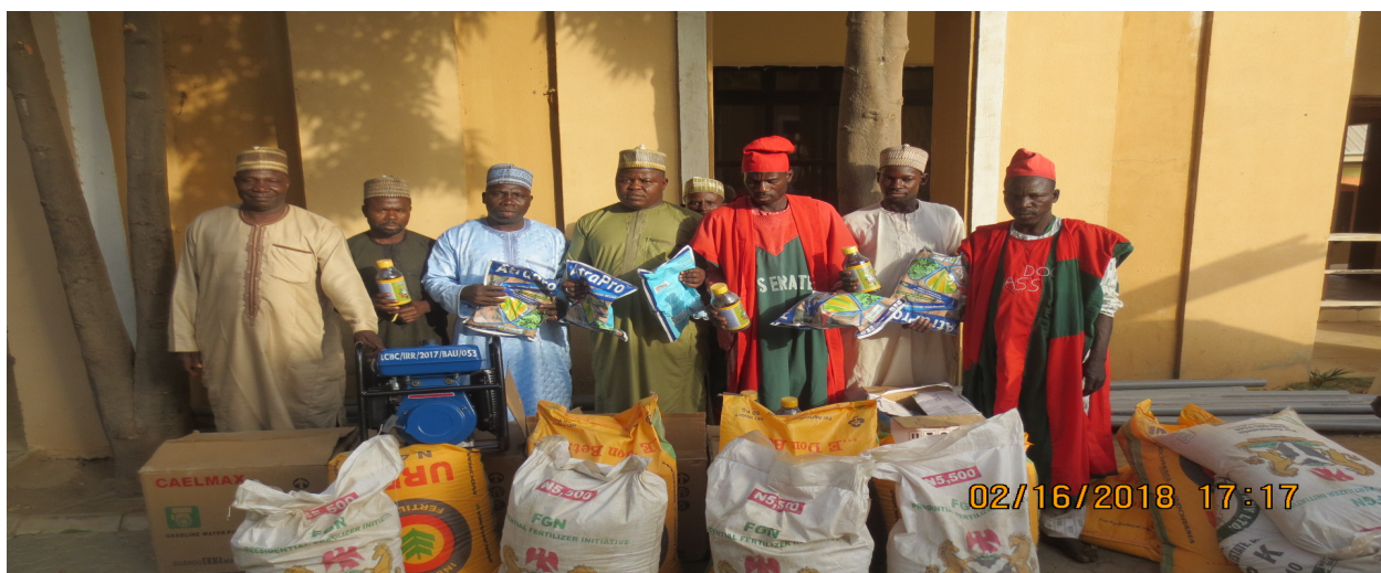
Some beneficiaries in Dass showcasing the package