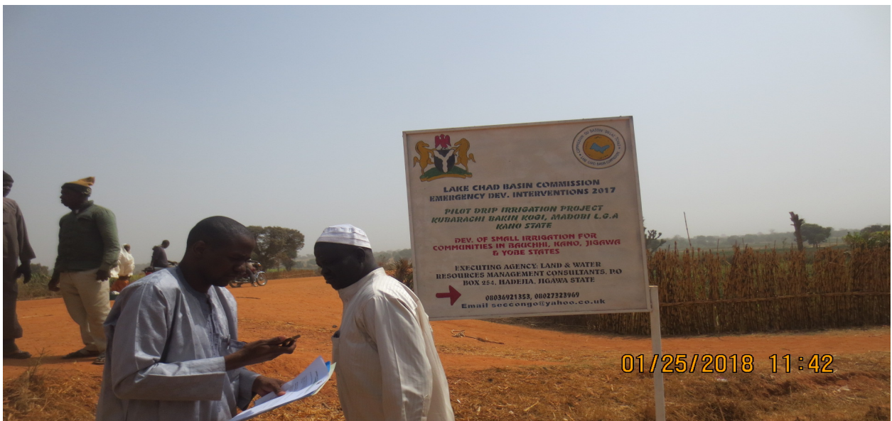
Plate 2: Completed site of Drip Irrigation plot awaiting planting in Baturiya, Kiri Kasamma LGA, Jigawa State