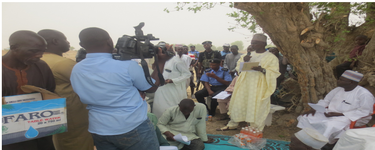
Plate 5 Coordinator of Land and Water Resources Management Consultants responding to questions during commissioning at Garin Gada, Nangere LGA Yobe State