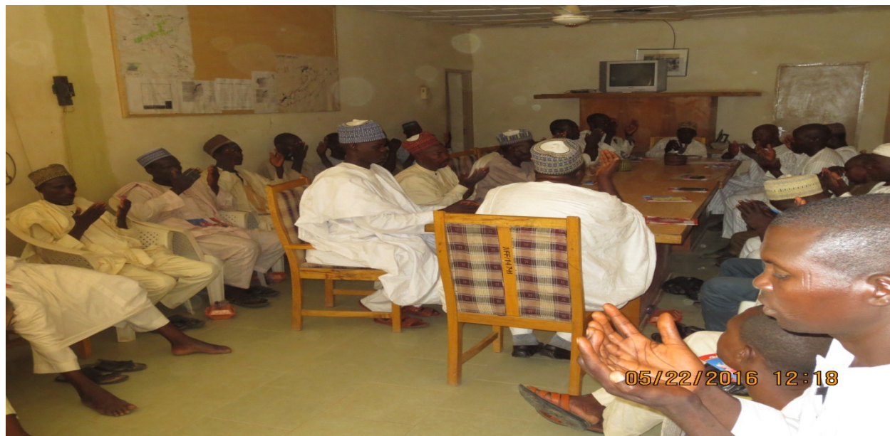
Plate 16: Cross-section of participants during the training on fish pond management

feeding, regular sampling to determine growth rate/daily weight gain, daily routine checks and record keeping. Other aspects of the training are common stocked fish diseases, their signs, prevention, control and management. Fish harvesting, pond security and formation of pond management team as well as proceeds management (re-investment, community development activity/project from the income). At the end of the training a guide to fish pond management was produced in English and translated into Hausa for the trainees.