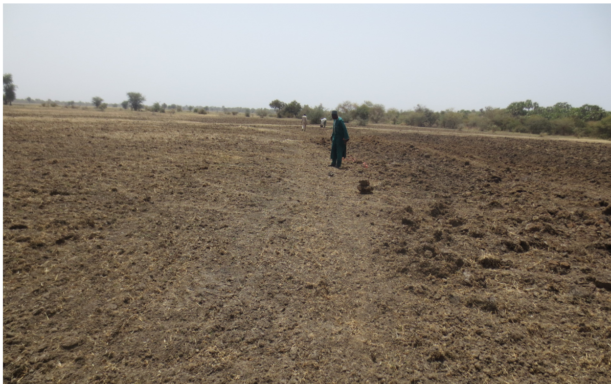
Ploughed and harrowed site in Dachia, Jakusko, LGA, Yobe State