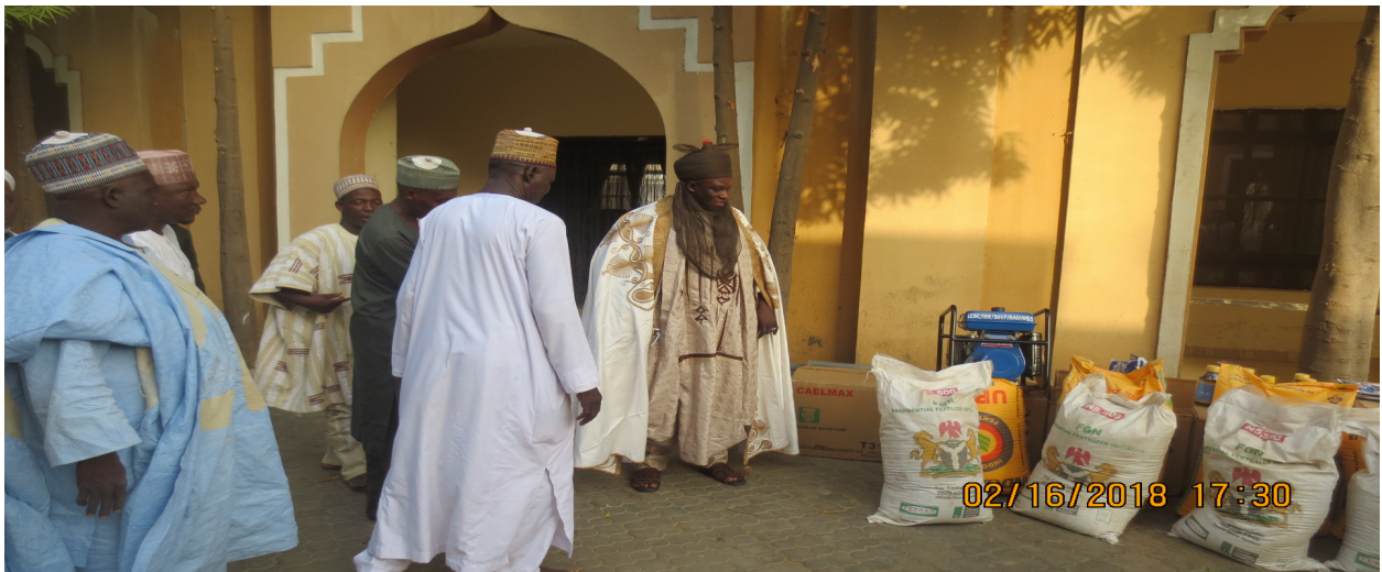
Emir of Dass inspecting the irrigation package in his palace