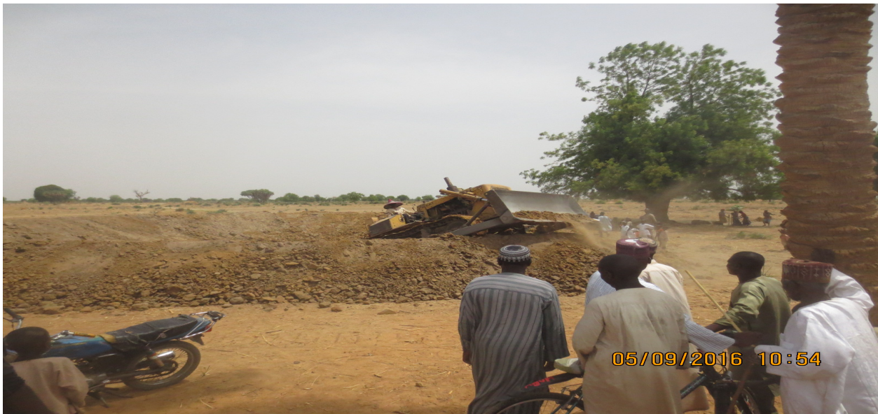
Plate 4: Fish Pond under construction in Baturiya

The pond dimensions range between 15 by 10 metres to 15 by 15 metres wide depending on community preference; water depth ranges between 1.5 to 2.1 metres. All the ponds were constructed, fenced and treated with lime. Cattle dung was also applied to enhance soil fertility in the pond and to facilitate the growth of natural fish food in the pond water. Sequence of the construction is given below.