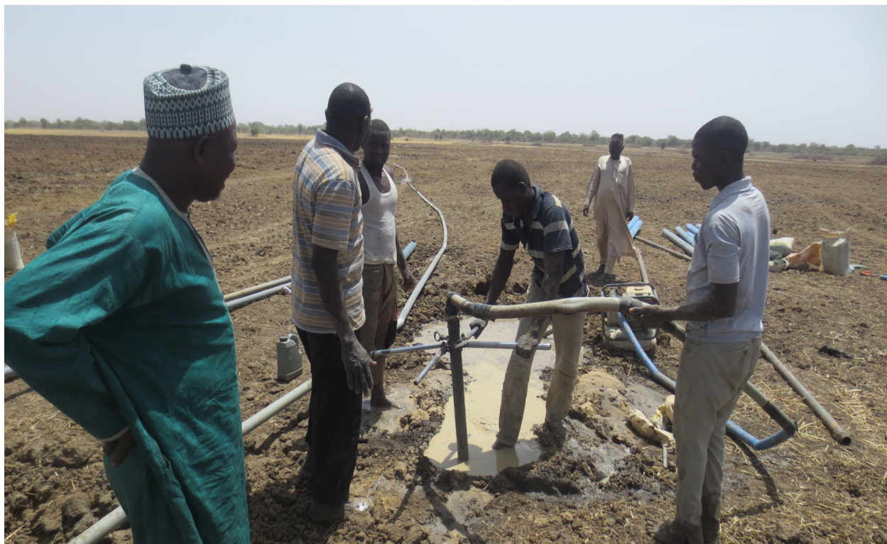
Drilling going on in Dachia, Jakusko LGA, Yobe State