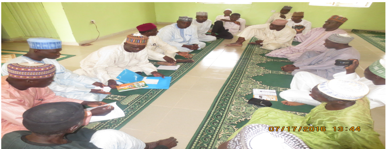
Plat 6: Meeting of LCBC mission with beneficiaries of fish pond project in Itas, Itas-Gadu LGA, Bauchi State