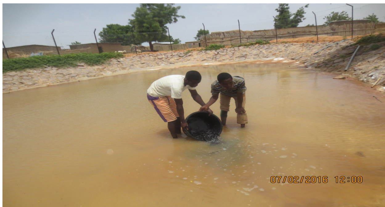
Plate 18: Pond Socking in Yakasawa