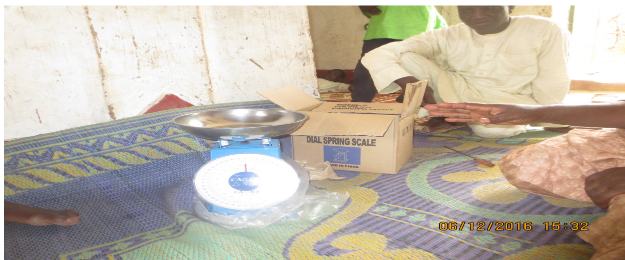
Plate 20: Weighing scale provided to each community under the project