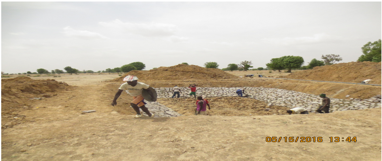
Plate 8: Stone pitching in progress in Hadin