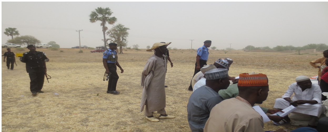
Plate 1 Security setting on farm during the commissioning, of LCBC Drip Irrigation Project in Yobe State at Garin Gada, Nangere LGA Yobe State