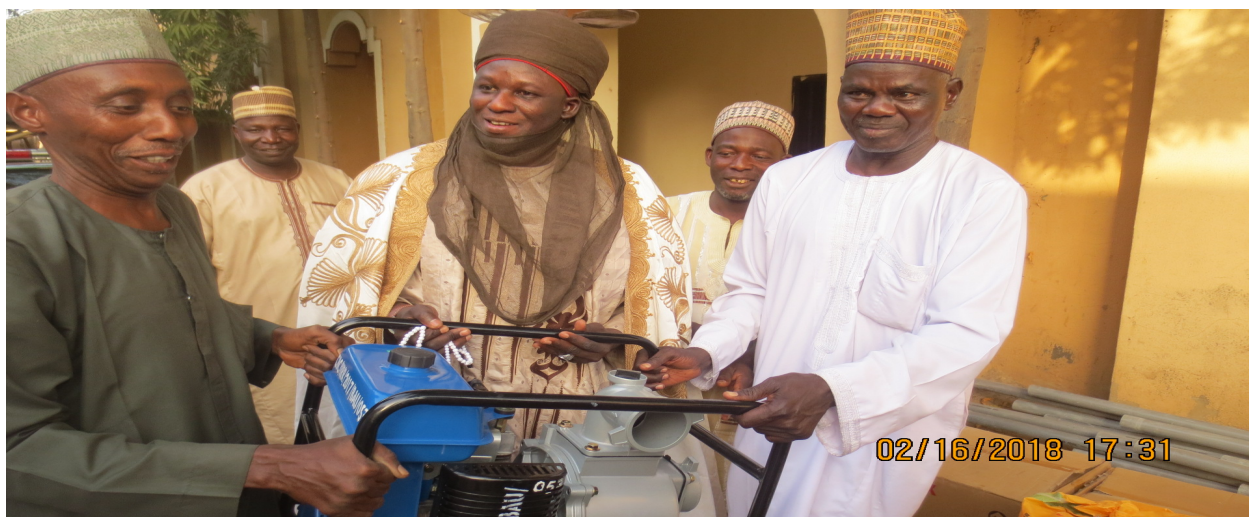
Emir of Dass Alhaji Usman Bilyaminu Usman presenting water pumps to beneficiaries in Dass Bauchi State