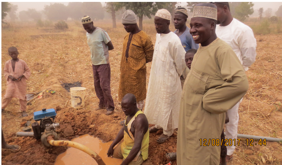
Plate 10: Drilling works going on in Kubarachi Site, Kano State

ple pictoral activity displays of the project are given below: