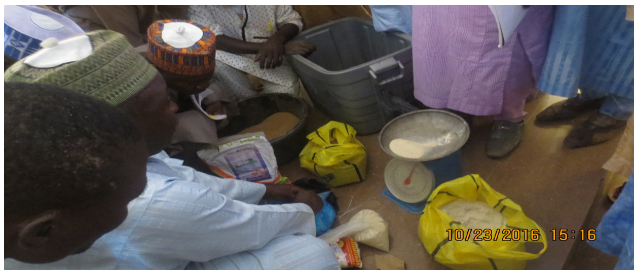
Plate 17: Weighing of ingredients for fish meal formulation in the training