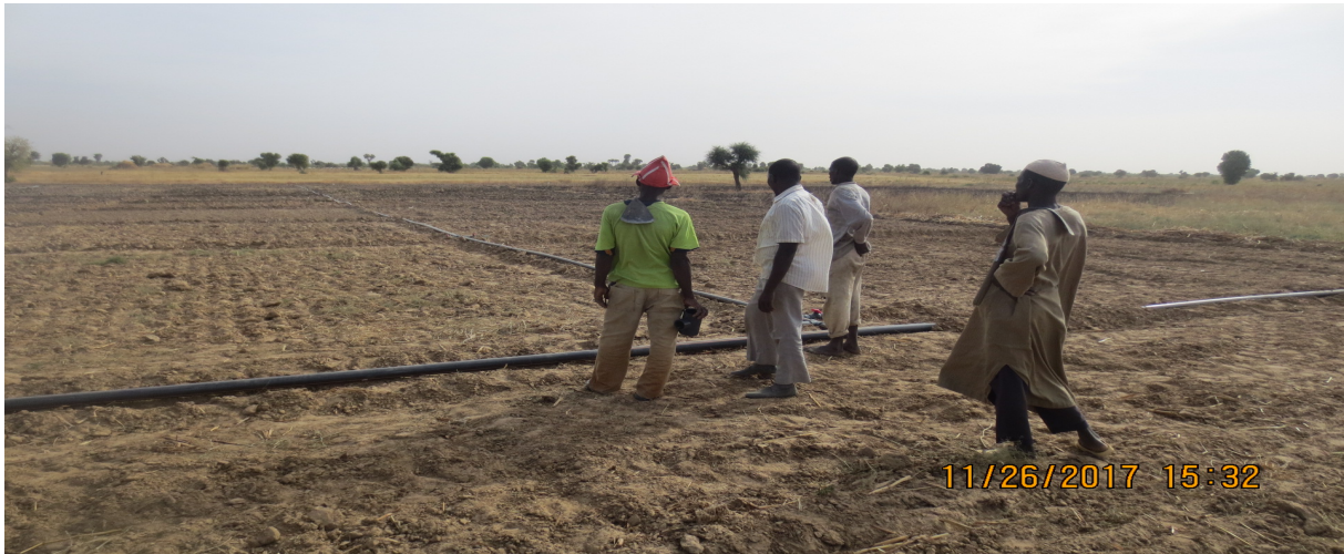
Plate 6: Another view of ppe laying in Baturiya, Kiri Kasamma LGA, Jigawa State