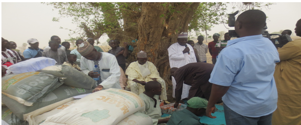
Plate 2 Display of inputs for distribution to beneficiaries at Garin Gada, Nahgere LGA Yobe State