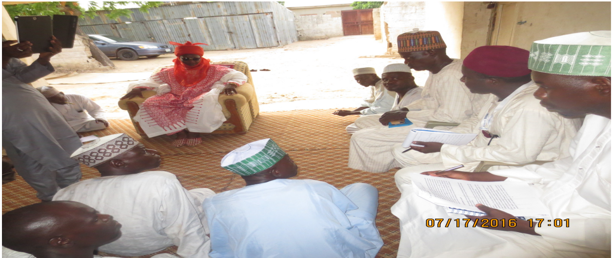
Plat 4: Meeting of LCBC mission with District Head of Sakwa and beneficiaries of fish pond project in his place