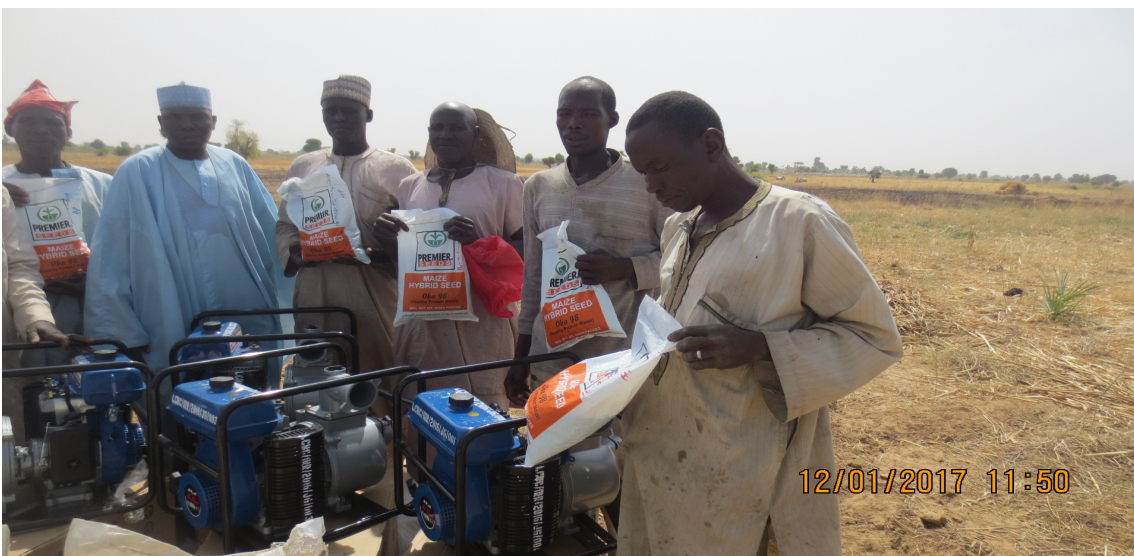
Plate 9: Some of the eneficiaries in Jigawa State displaying the water pumps and seed gien to the under the LCBC Irrigation Project