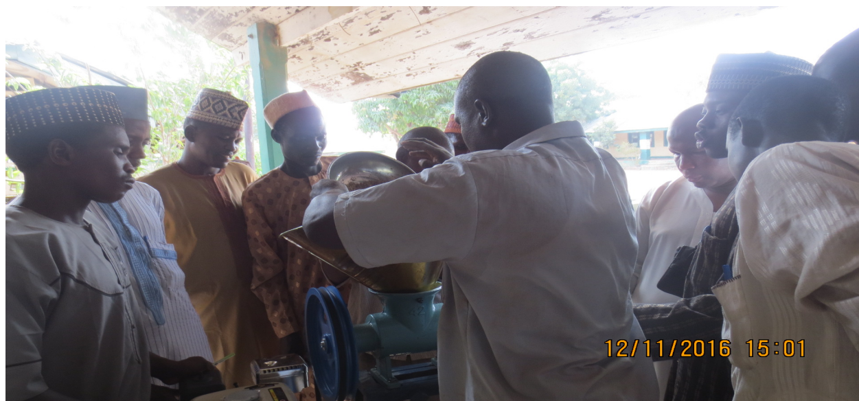
Plate 19: Beneficiaries of fish pond project from Kano State formulating fish meal using machine during their training in Kano