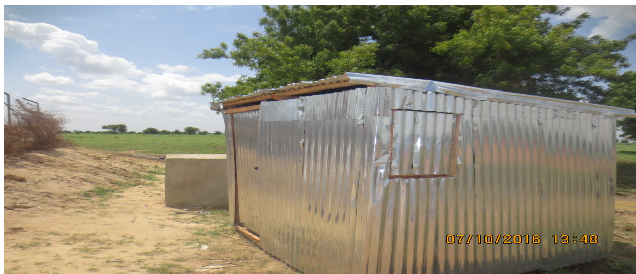
Plate 21: Security Guard's Room at Baturiya