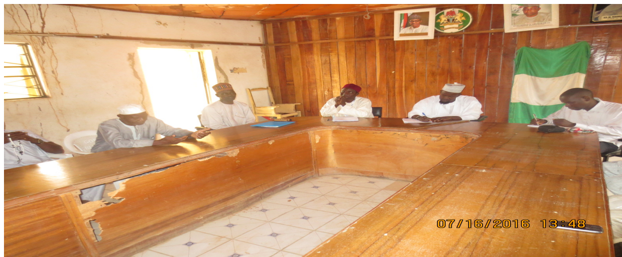
Plat 3: Meeting of LCBC mission with beneficiaries of fish pond project in Katagum, Zaki LGA, Bauchi State