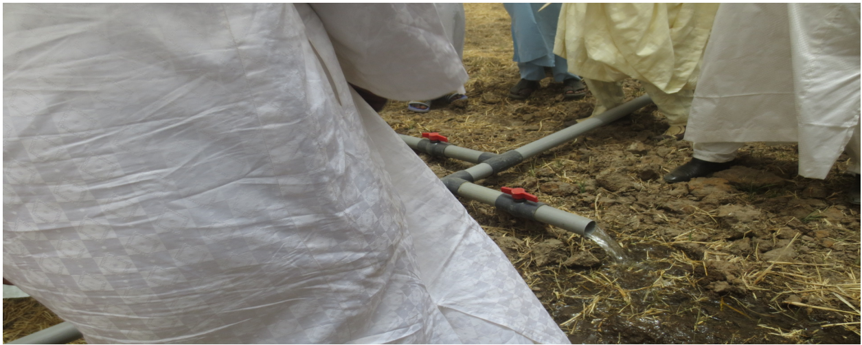
Plate 10 Testing the project's function during commissioning