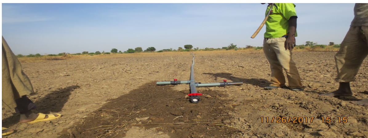
Plate 3: Another of the cleared and piped site in Baturiya, , Kiri Kasamma LGA, Jigawa State