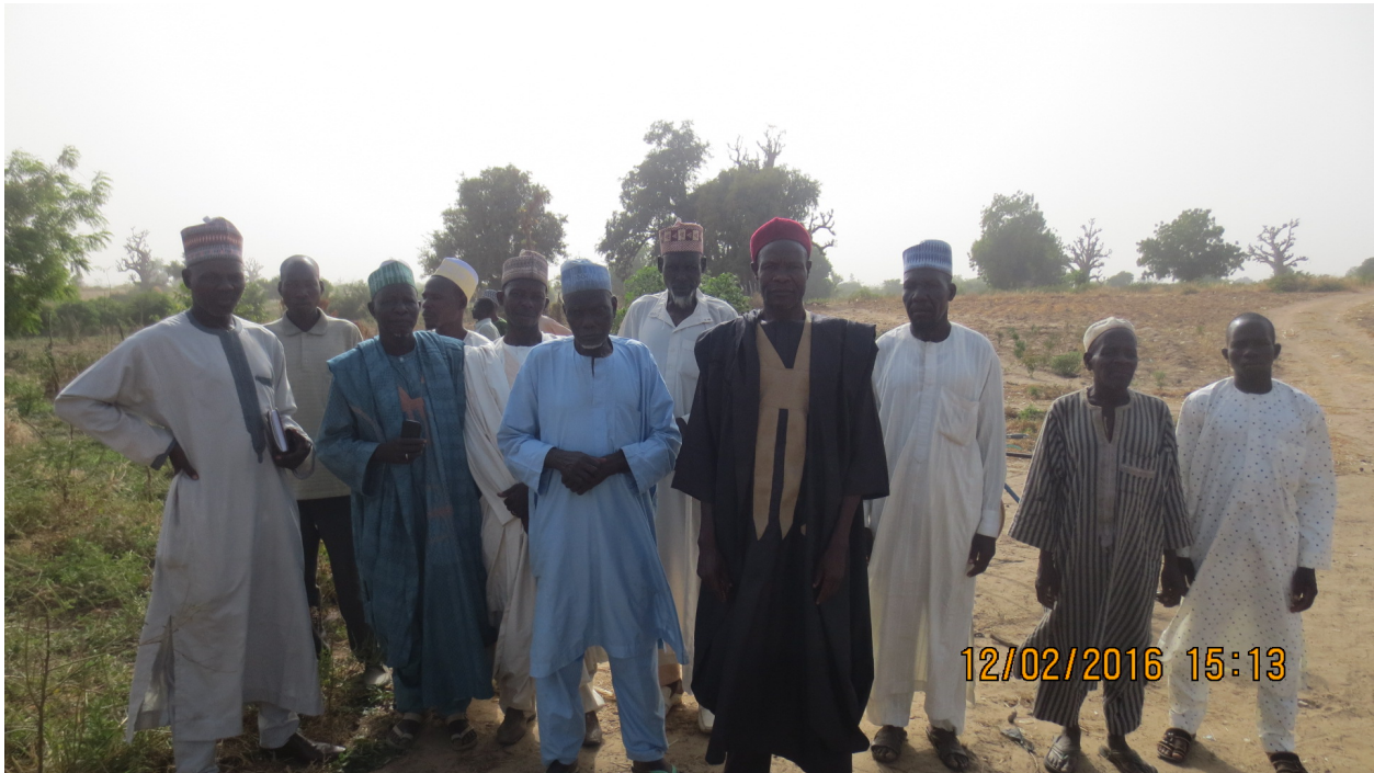
Plate 7: Group picture with village Head and community elders after site handing over in Kotorko, Yobe State