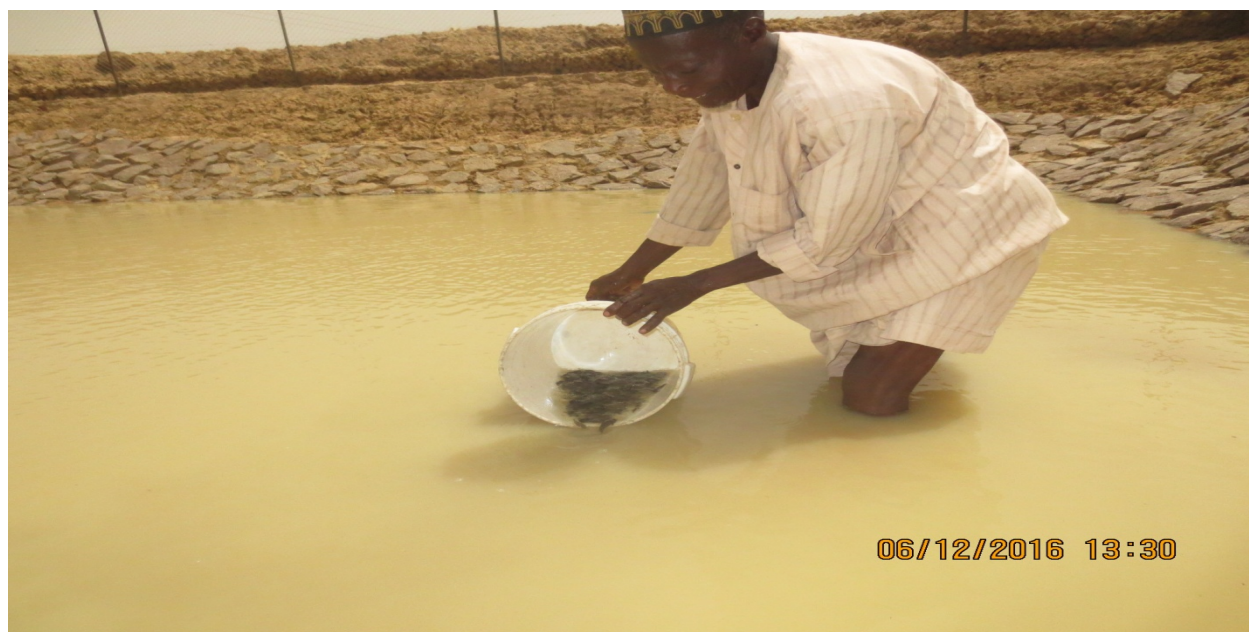
Plate 17: Pond Socking at Hadin

Five Thousand (5000) Clarias gariepinus (catfish) juveniles, each juvenile had an average weight of 5 grammes were stocked in each pond. This species has high level of tolerance to stress;