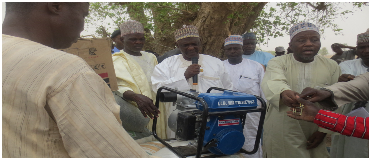
Plate 7 Presentation of water pump to beneficiaries