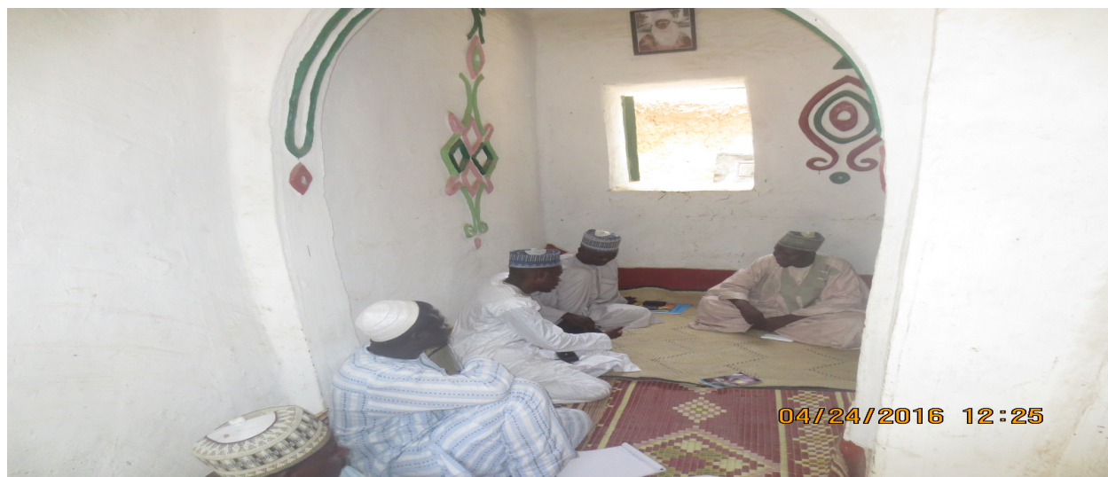
Plate 1: Consultation with fish pond benefitting community, Baturiya, Kirkasamma Local Government, Jigawa State, Nigeria