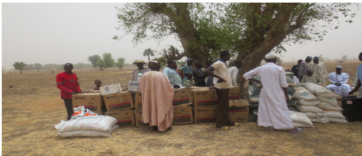
Plate 3 Display of water pumps and other inputs during the commissioning of LCBC Drip Irrigation Project, Garin Gada, Nahgere LGA Yobe State