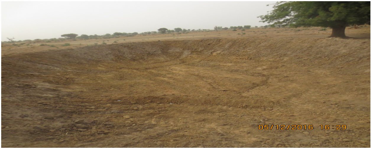
Plate 7: Earthwork completed Baturiya Fish Pond