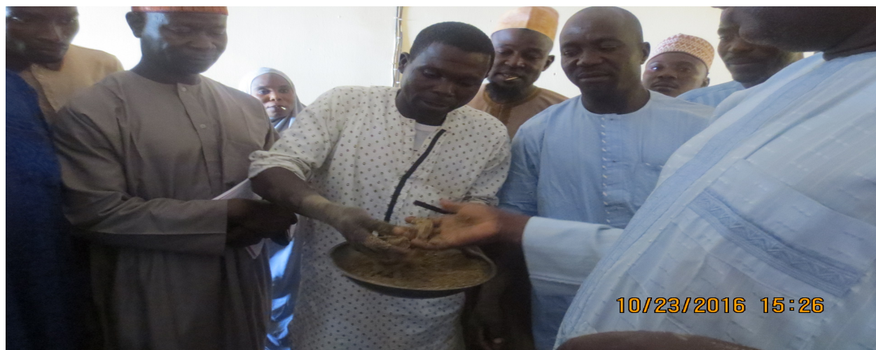
Plate 18: Fish meal produced during the training