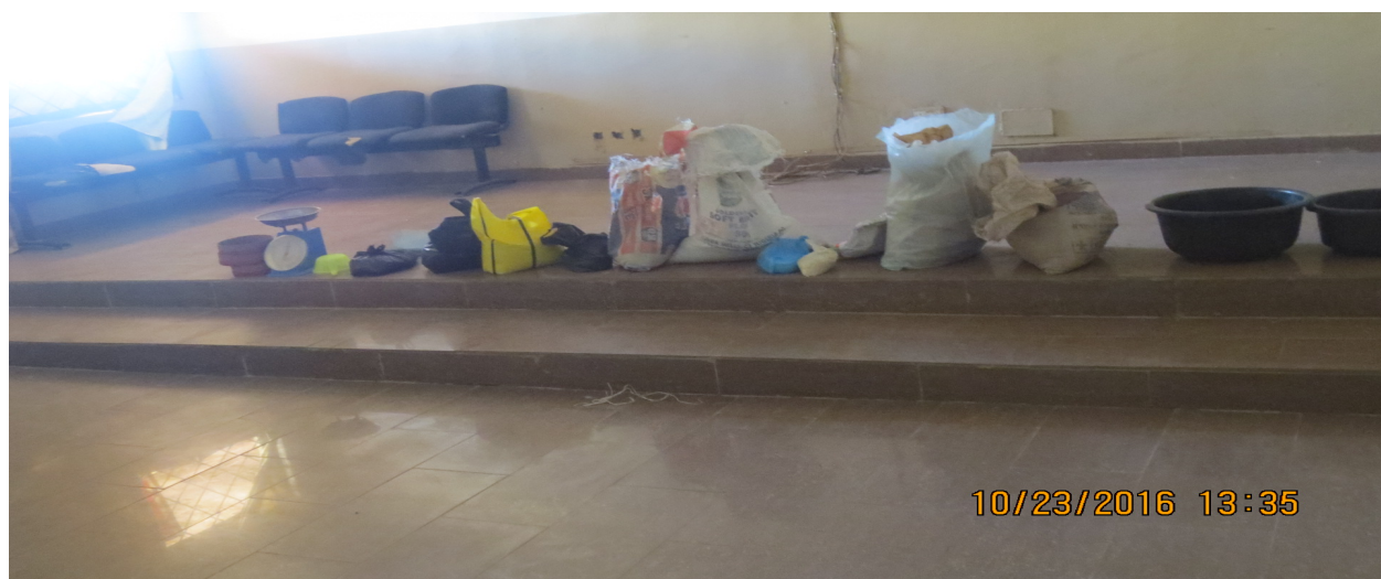
Plate 16: Ingredients for demonstration of local fish meal practical demonstration to participants