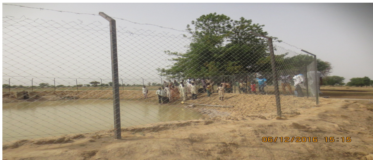
Figure 11: Completed Fish Pond in Baturiya during stocking