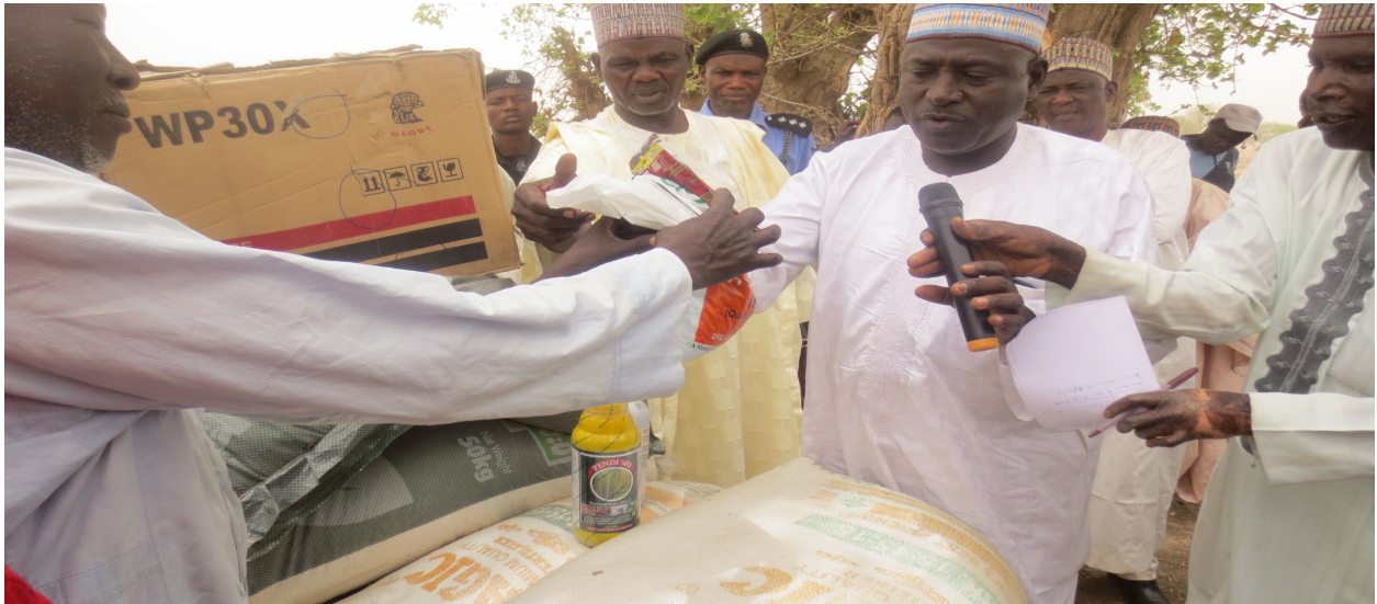
Plate 8 Chairman Nangere Local government presenting inputs to beneficiaries