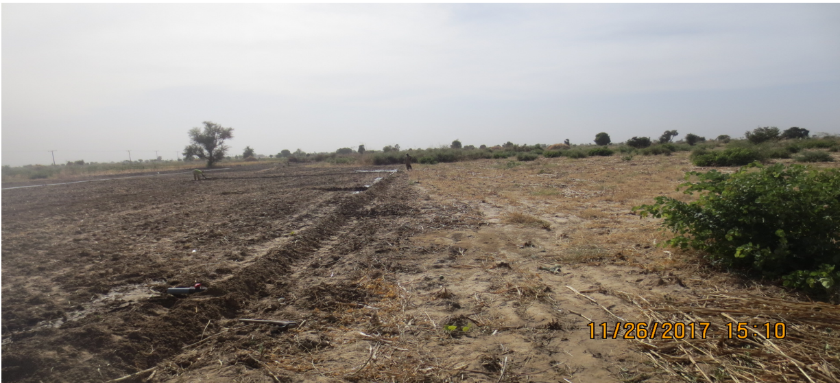
Plate 1: Cleared and covered pipes site of Drip Irrigation in Baturiya, Kiri Kasamma LGA, Jigawa State