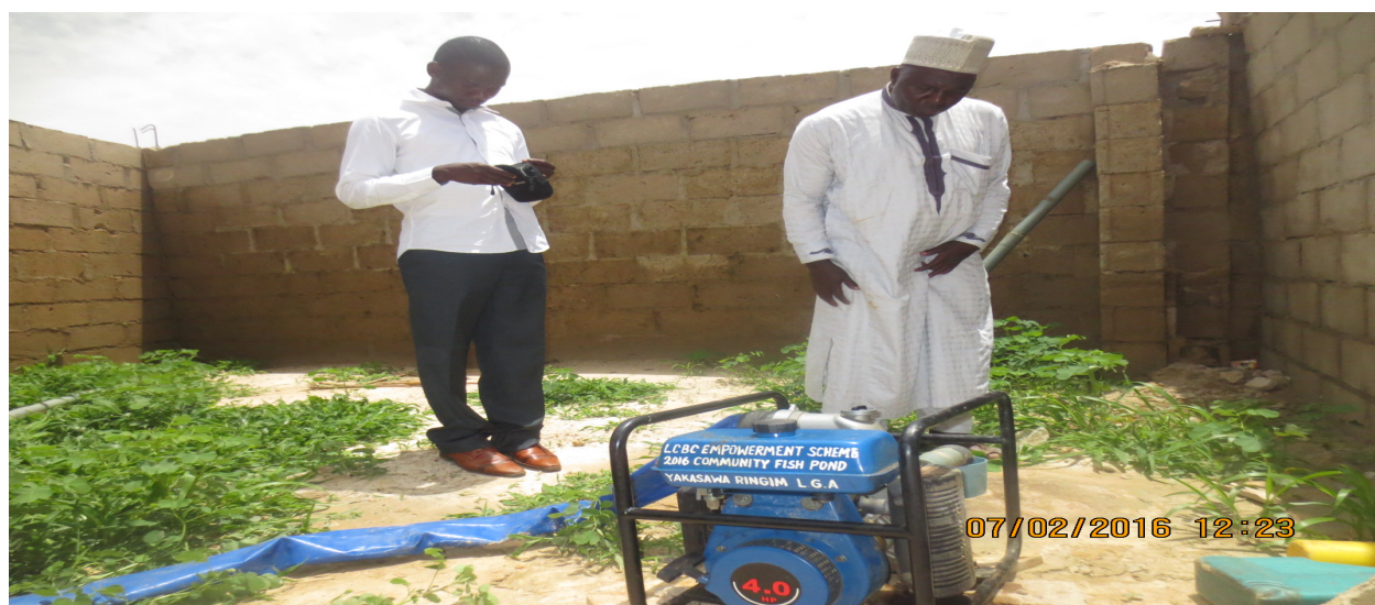
Plate 19: Water Pump for Yakasawa Fish Pond