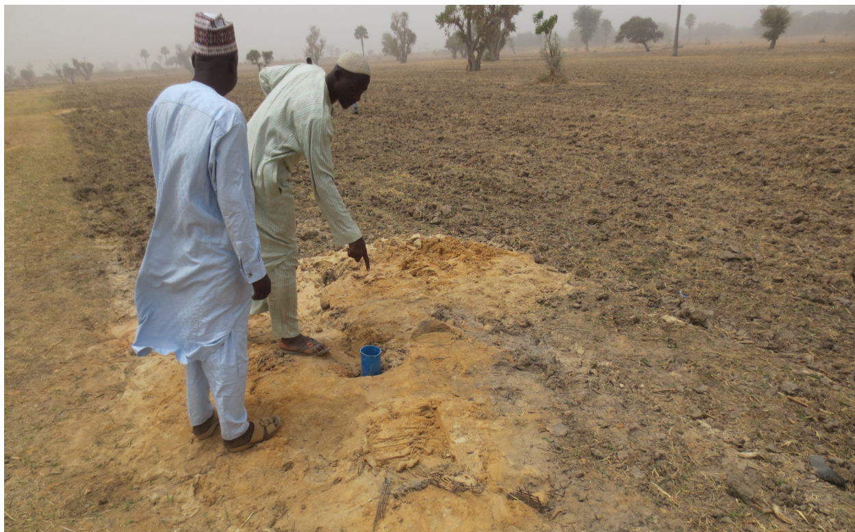
Inspecting wells at Dachia, Bursari LGA, Yobe State