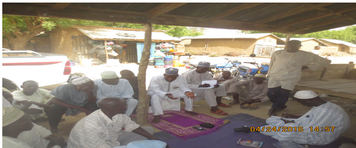
Plate 2: Consultation with fish pond benefitting community, Hadin, Kaugama Local Government, Jigawa State, Nigeria