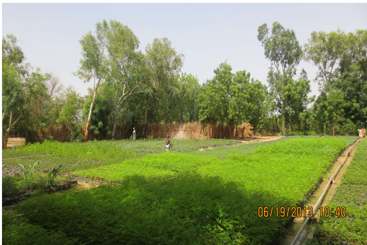
One of the nurseries where the seedlings were raised for the contractors

LCBC executed the scheme through PRODEBALT Project and Prodebalt in turn engaged a contractor for the job. The contractor was sub contracted seedlings production and planting to professional foresters in the states. The seedlings were raised in tree nurseries. The seedlings were inspected by a combined team of PRODEBALT regional and national monitoring and evaluation officers and HJKYB-FT team prior to planting. The inspection team ensured that the seedlings were the species in the Bill of quantity and reached the required planting size before giving the contractor the permission for the commencement of planting in August.