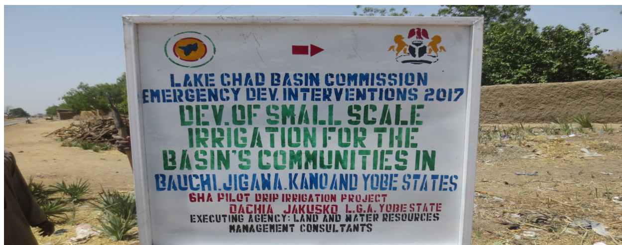
Signboard in Dachia, Jakusko LGA, Yobe State