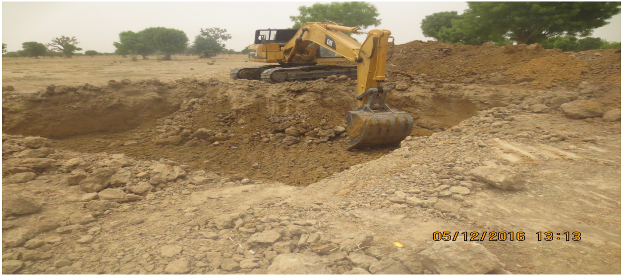
Plate 5: Fish Pond construction in progress in Hadin