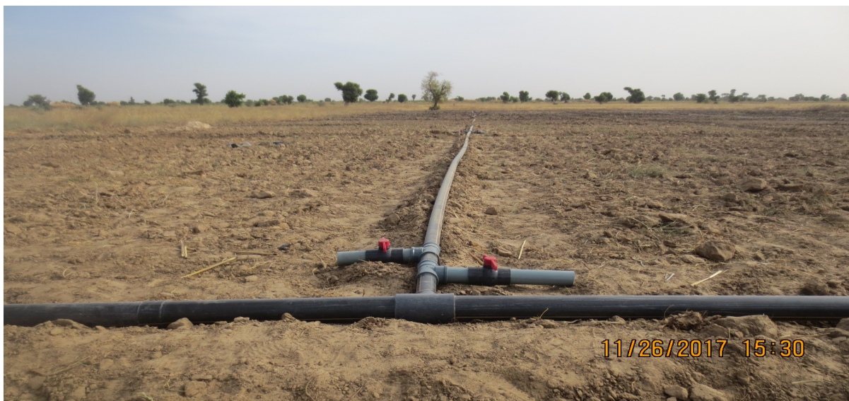
Plate 5: Pipng in progress, before earthing the pipes in Baturiya, Kiri Kasamma LGA, Jigawa State