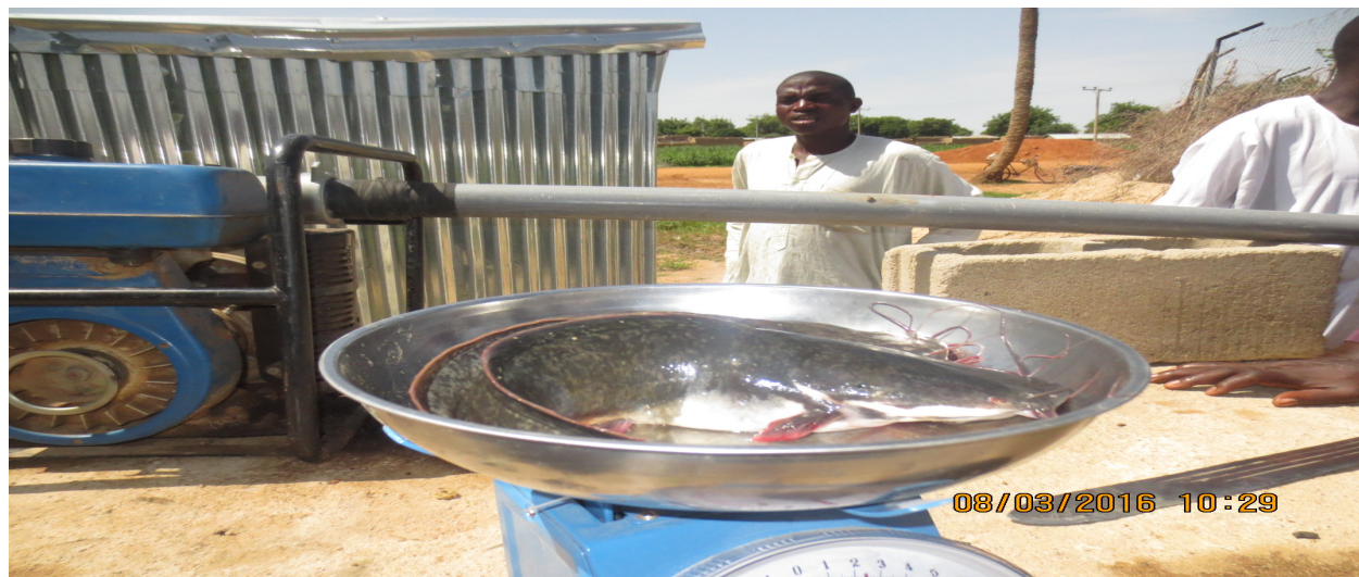
Plate 5a: Sampling at Baturiya community fish pond