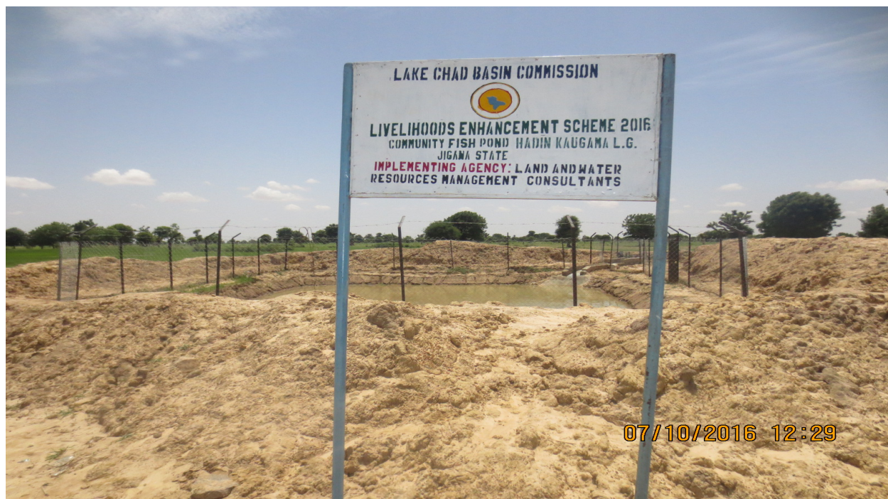
Plate 13: Completed and Stockrd Pond wih Signboard at Hadin