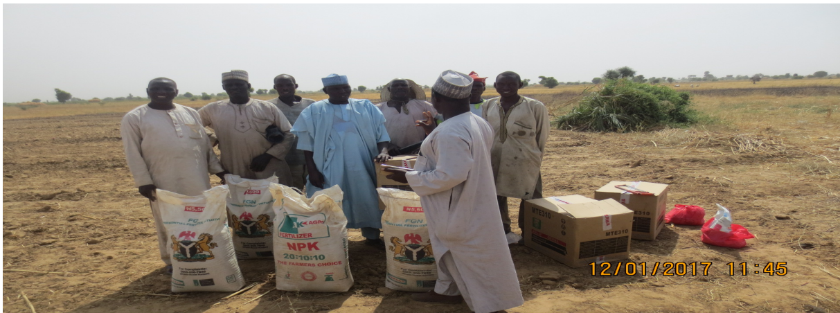
Plate 7: On-field training for beneficiaries at Baturiya