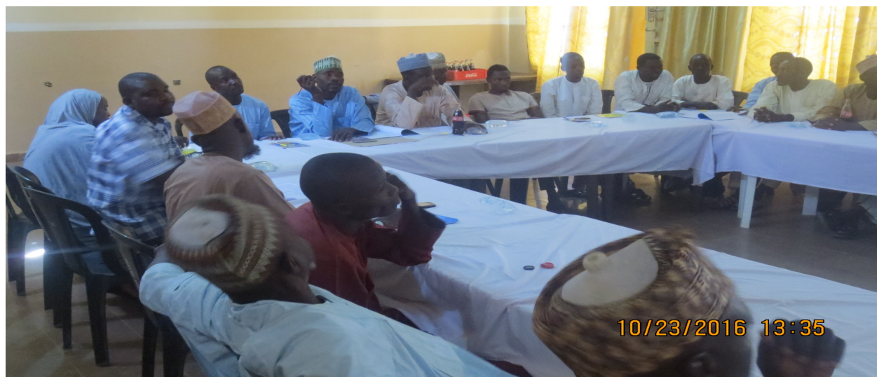
Plate 15: Cross-section of participants at the training of beneficiaries on fish pond management and fish meal formulation in Azare, Bauchi State