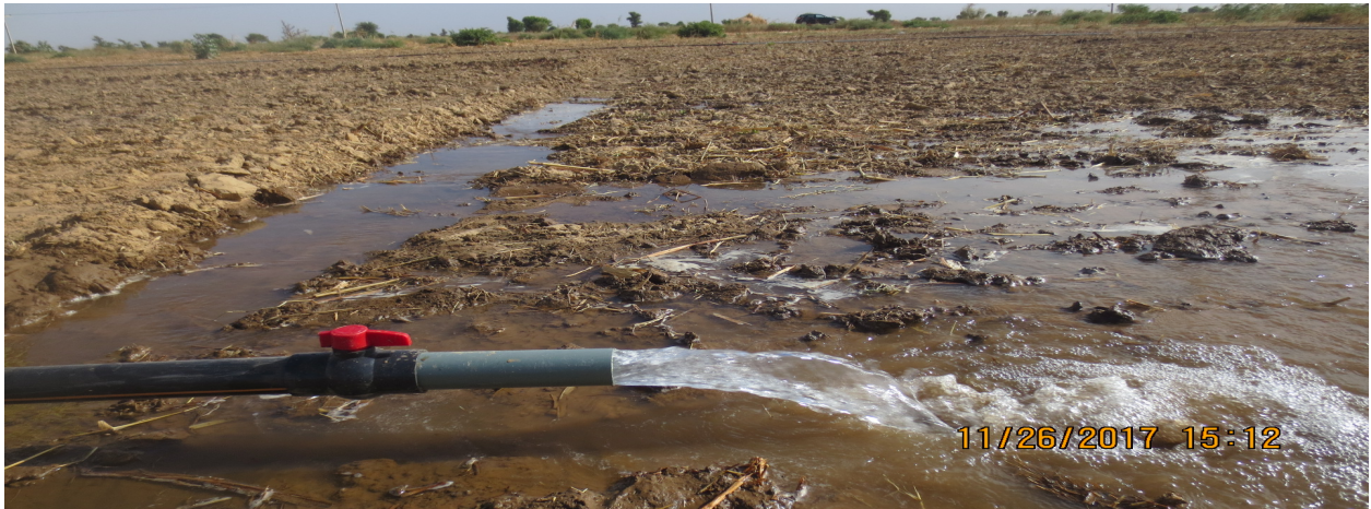
Project Inspection by LCBC Mission