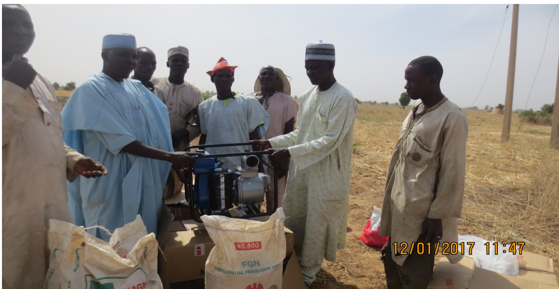
Plate 8: Village head of Baturiya receiving water pumps and fertilizers on behalf of the beneficiaries of his community