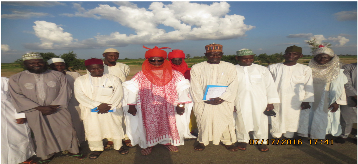
Plat 5: Group photograph with District Head of Sakwa after handing over of fish pond site