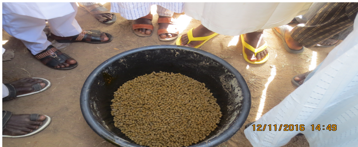
Plate 20: Fish meal produced by beneficiaries at the training in Kano