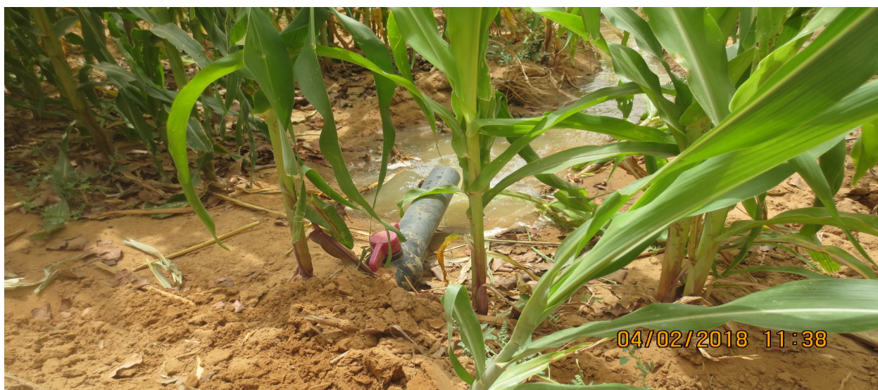
Demonstration of Califonan Irrigation Sytem