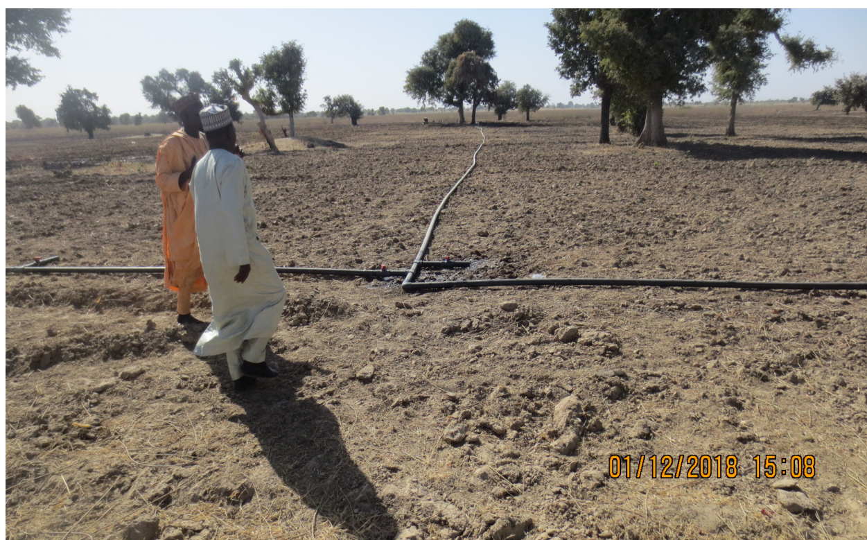
Laid pipes prior to coering them