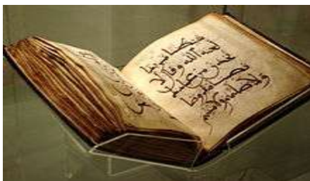
11th-century North African Qur'an 4