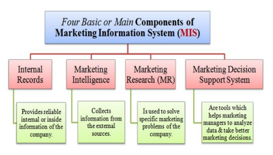
Figure 1.Components of Marketing Information System (MIS) [8]