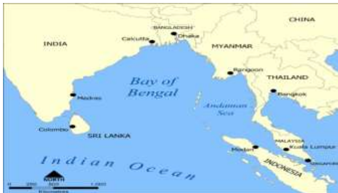
Map-1: Location of Bangladesh and geo-strategically pivot

This paper covers Geopolitical significance of Bangladesh and its foreign policy decision making. It was assumed that end of cold war means end of geo-politics. At recent time the concept has changed - as geopolitical rivalries have stormed back to center stage. Whether Russian forces seize Crimea, China making aggressive claims in its coastal waters, Japan responding with an increasingly assertive strategy of its own, or Iran is trying to use its alliances with Syria and Hezbollah to dominate the Middle East, old-fashioned power plays are back in international relations. 25 Bangladesh and its geopolitical location attract world powers concern. To examine how Bangladesh is a strategic pivot of Bay of Bengal and Indian Ocean is given below -