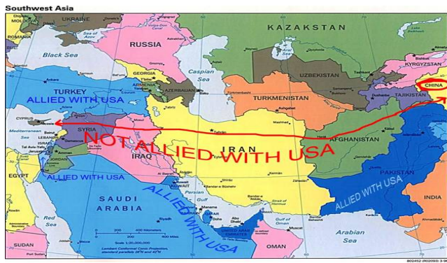
Figure II: ‘ISIS –An American-CIA-Mossad-Saudi Intel Covert Operation’ Retrieved from http://www.countercurrents.org/mithiborwala130914.htm

□ If Russia & Iran were to have sovereign control over their Oil-Gas resources which they transported via their pipelines, then Russia & Iran would effectively control up to 50% of Gas exports to Europe challenging the hegemony of the USA (Mithiborwala, 2014).