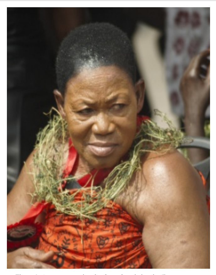
Figure 1: A woman wearing the dansinkran hairstyle. (Image courtesy: Godhit, 2017).

One could differentiate between a maiden and a married woman just by looking at the hairstyles they wore. The people also used natural hair treatments that conditioned and softened it to keep it in good shape. The Akan often said əbaa n'enyimyam nye ne tsirhwin which literally means 'The glory of a woman is her hair.' This expression underscored why women in precolonial Ghana cared so much about their hair. They spent a great deal of their time in pursuance of their hair beauty culture practices. During puberty rites, female adolescents are given special education on hygiene, good grooming and hair beauty culture practices and treatments because of the premium society placed on the hair. Consequently, hair became a significant communicative symbol used to express moods such as bereavement, joy; and in some cases, power and authority. For example, a male child who lost his father, mother or close relation cut the hair down to the skin (Figure 3). He appeared hairless on the head as a sign of bereavement. Some Akan female adults wore a hairstyle called takua, done by holding the hairs together atop the head and with thread to stand upright. To them, such a hairstyle is design-less and simple in paying homage to the dead.