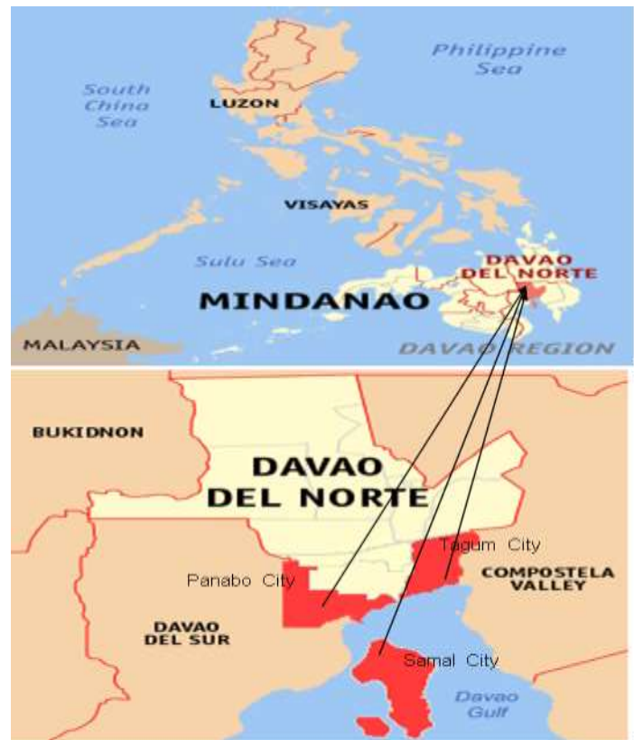
Figure 2. Map of the Philippines highlighting the Research Locale

While Tagum City, known as the Palm City of the Philippines and the capital of Davao Del Norte province, has a population of 259 444 as of the 2015 Philippine Census. The city has 23 barangays sitting on 19 580 hectares of land territory. Figure 2 shows the map of the Philippines and the location of the town.