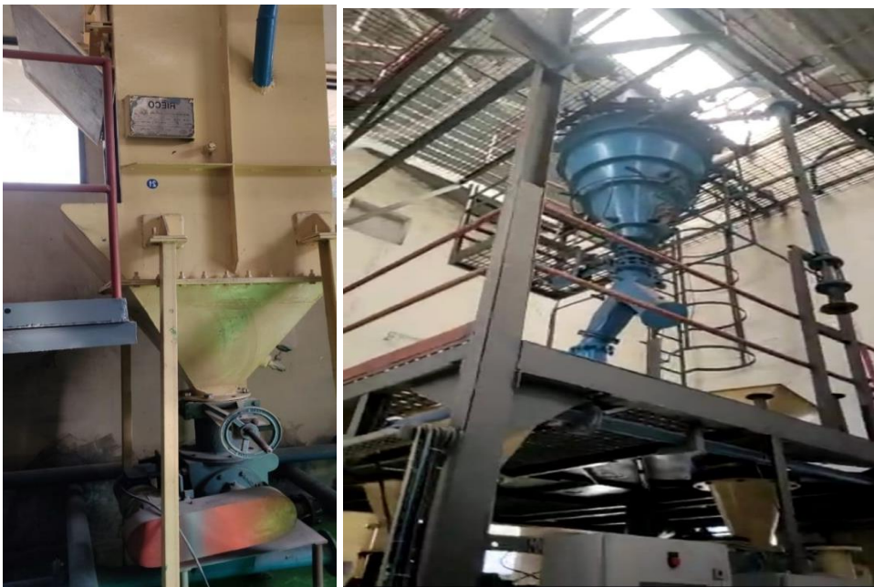
Pic3: Collection filter

At first, fed the material in feed station through batch wise as can see in fig 2. The bin mounted vent filter which filters lighter density material and heavy density material after feeding all the material into the hopper. Material discharges to the conveying line via RAL. With provided vacuum to convey material system, pipe size that was used for experiment as 80NB and the total conveying length is about 60 meters. Material that used was Rice husk which has moisture of appx 30%. Viewing from sight glass to see the conveying material to observe flow patterns can be observed via sight glass and conveyed fines material were at collecting filter and then collected at collecting hopper. As there is 30% moisture in rice husk, initially fed the material dumped, simulating the site conditions where usually by means loaders will dump the rice husk for transportation. While doing so, observed the material sticking inside the rotary air lock and jamming occurred. This led to conduct the flowability test to record the flow properties of rice husk