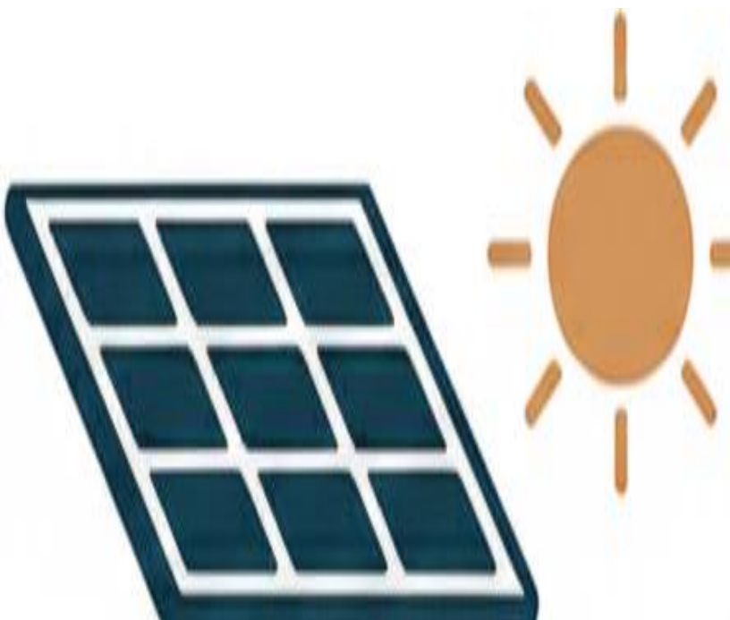
Figure 2 AI-Enhanced DC Solar Air Cooler Architecture